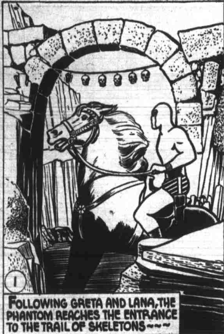
1 FOLLOWING GRETA AND LANA, THE PHANTOM REACHES THE ENTRANCE TO THE TRAIL OF SKELETONS ~ ~ ~