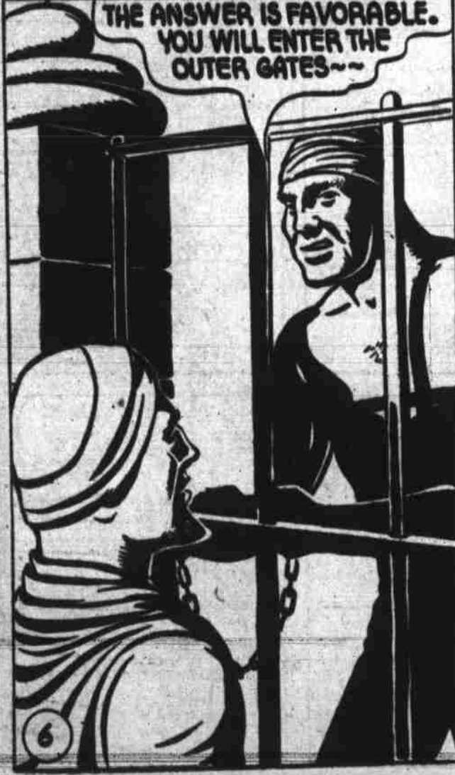
THE ANSWER IS FAVORABLE. YOU WILL ENTER THE OUTER GATES ~ ~