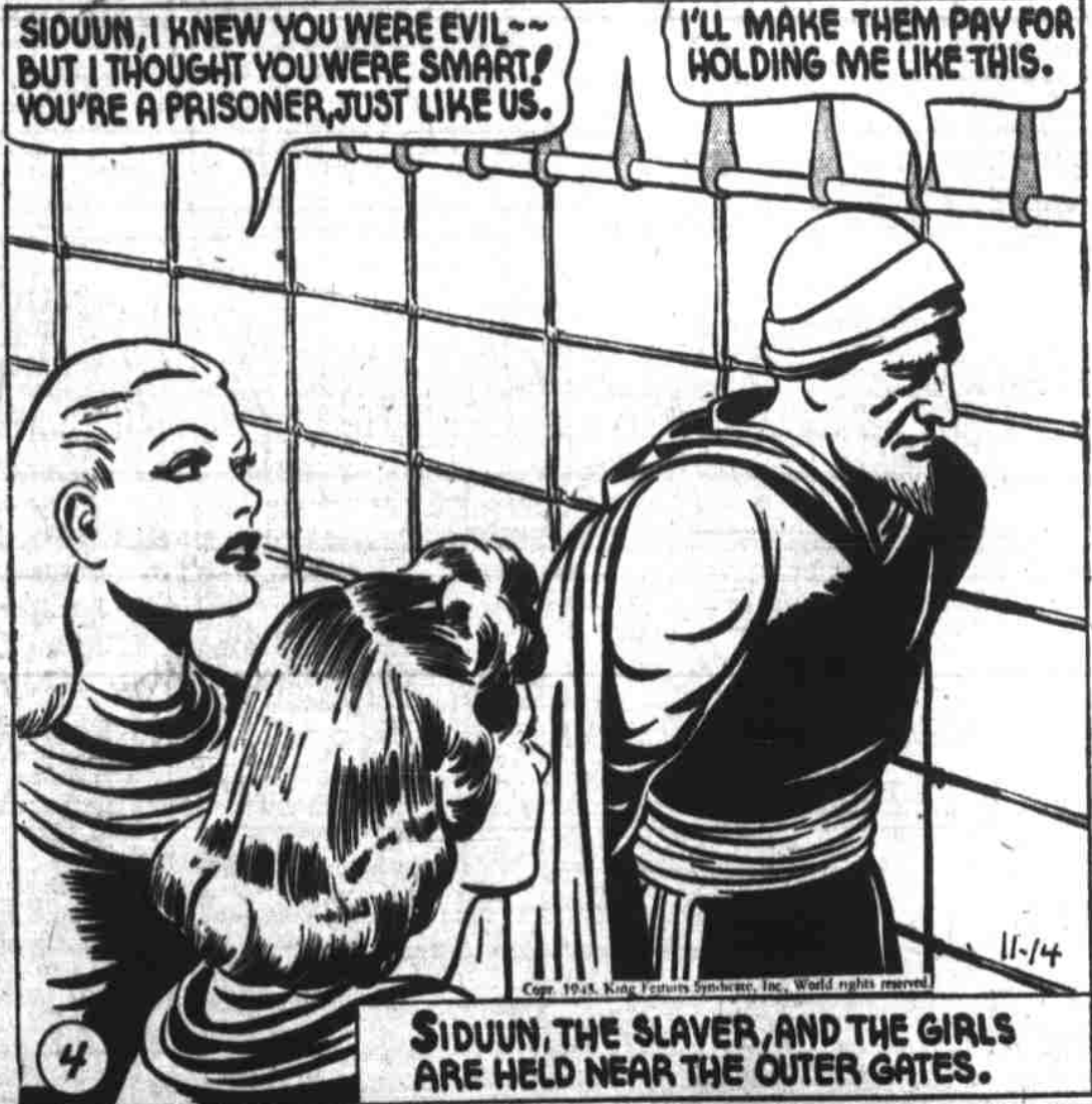
SIDUUN, I KNEW YOU WERE EVIL ~ ~ BUT I THOUGHT YOU WERE SMART! YOU'RE A PRISONER, JUST LIKE US.