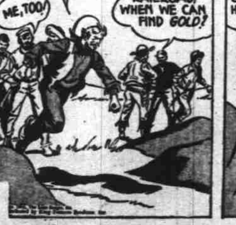
THE LONE RANGER