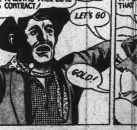
THE LONE RANGER