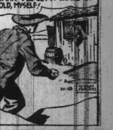
THE LONE RANGER