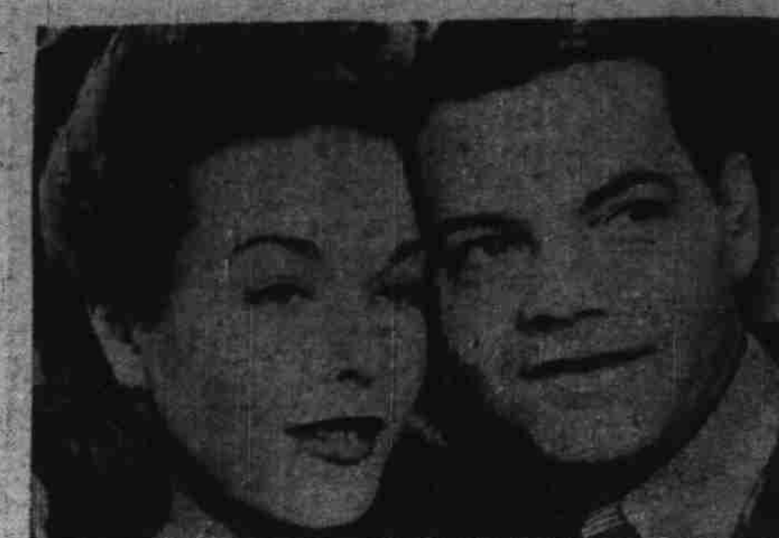
Joan Woodbury and Eddie Quillan together in "Here Comes Kelly" with Maxie Rosenbloom now playing at the Grand theatre. Second hit on this bill is "Destroyer" featuring Edgar G. Robinson, Glenn Ford and Marguerite Chapman. These two features play through Wednesday.