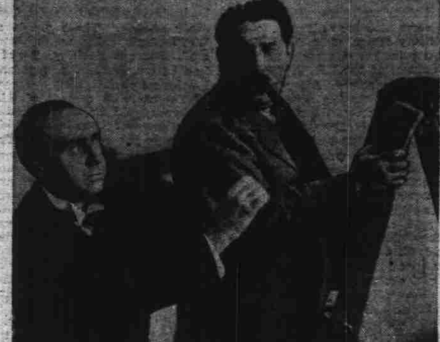
Charles Arnt and Harold Peary are shown in a scene from RKO-Radio's latest, "Gildersteeve's Bad Day," jamful of fun for all, with Jane Darwell. Plus second big hit! Acquaintance in "Captive Wild Woman," the fantastic tale of a half-beast, half-woman! At the Hollywood starting today.