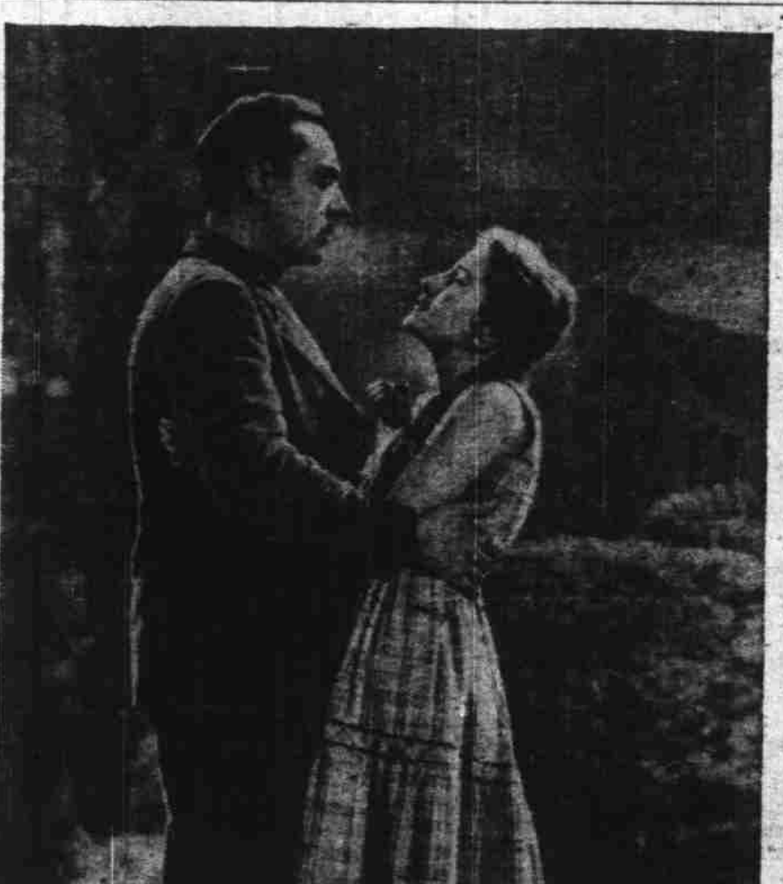
Boyer and Fontaine, the new love-team in Warner Bros. "Constant Nymph," a strange story of a man torn between two loves. Joan Fontaine as Tessa the untamed child of nature, brings to Lewis Dodd, Charles Boyer, the "heart" that his music needs, but at the same time complicates his life as he is already married to Florence Churchill, Alexis Smith. Also in the cast are Brenda Marshall, Peter Lorre and Charles Coburn. This great love story starts today at the Elsinore theatre. "Mexican Spitfire's Blessed Event," starring Lupe Velez and Leon Errol completes the double bill.