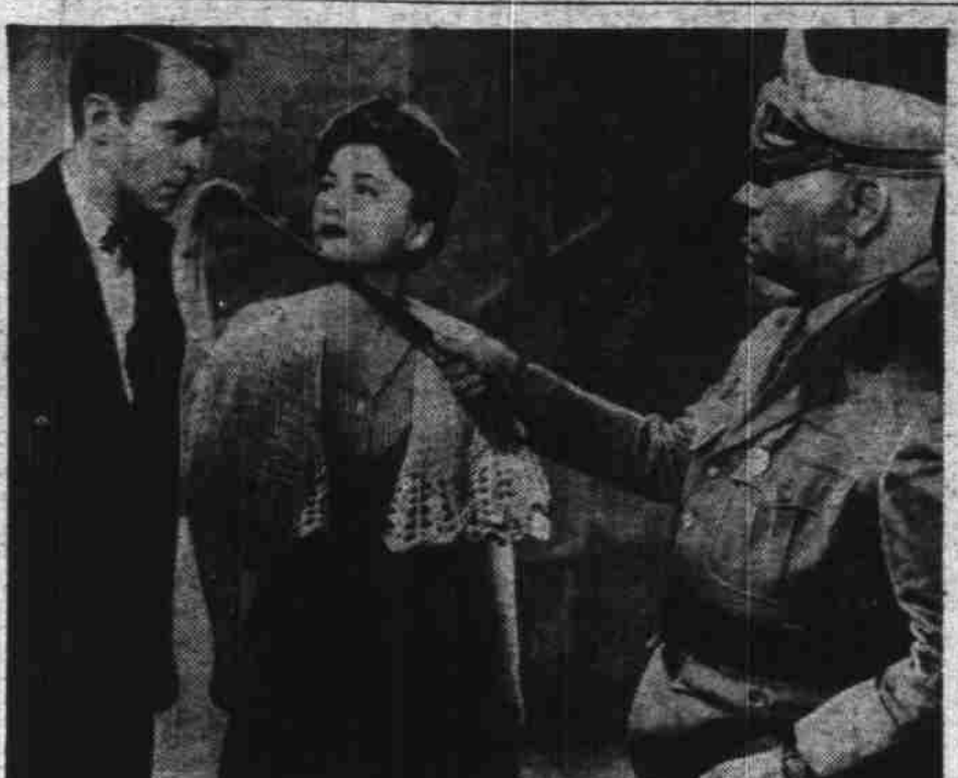
Drama in the North African desert reaches a high pitch in Paramount's exciting adventure, "Five Graves to Cairo," now playing at the Capitol theatre with Franchot Tone, Anne Baxter and Erich von Stroheim (shown above) in the principal roles. The story has to do with intrigue behind the rout of Rommel in Africa. Erich von Stroheim portrays Rommel. "Over My Dead Body," starring Mary Beth Hughes and Comic Milton Berle completes the double bill at the Capitol.