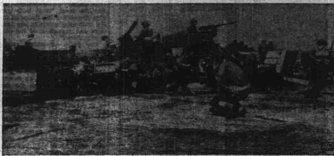
Yanks pour ashore quickly at Salerno, most of them taking scant heed of a German 88mm cannon shell exploding nearby. In the foreground a military policeman ducks.