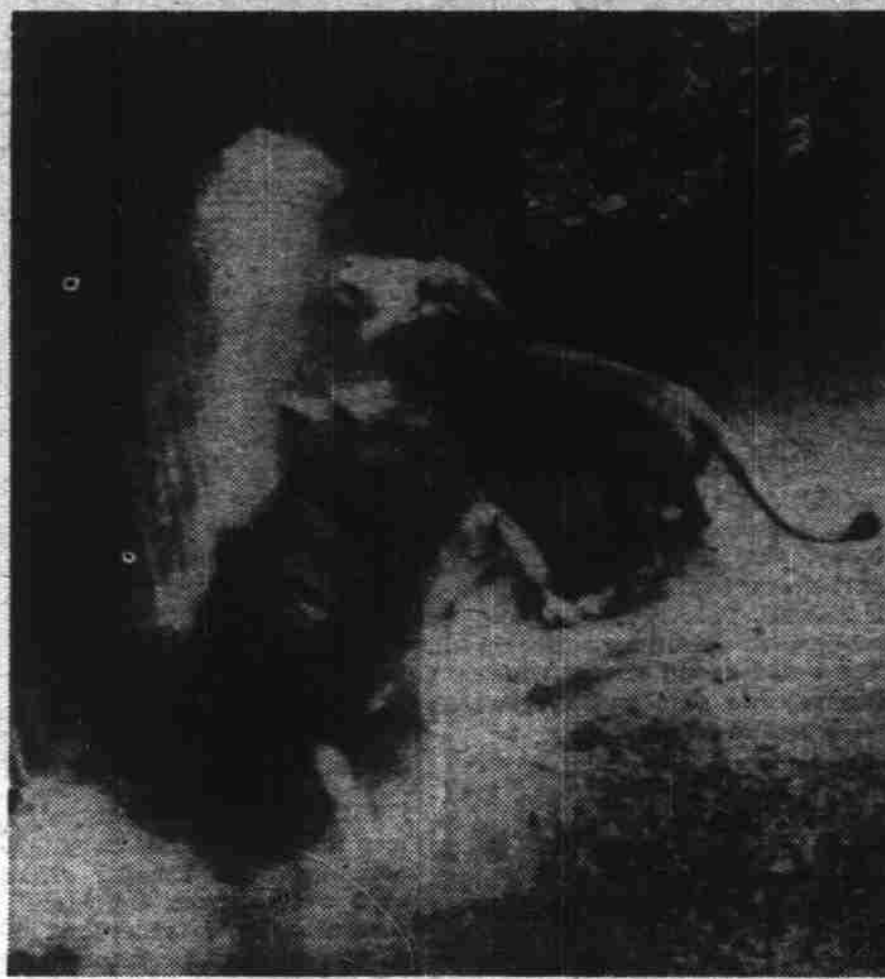
Johannie and Harry, brother lions in the African Plains exhibit in the New York zoological park, battle over an eight-pound chunk of horse meat at feeding time. Johannie's larynx was fractured in the 10-minute fatal jungle spectacle, witnessed by 60 spectators. Another lion (background) waits for some more meat to be tossed into the pen.