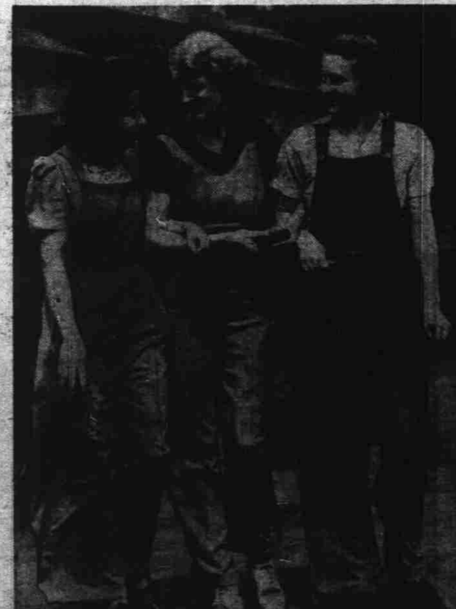
LADY AT WORK—Lady Lyttelton (center), wife of Britain's minister of production, engaged with two fellow-workers entering the factory where they make fittings for aircraft parts.