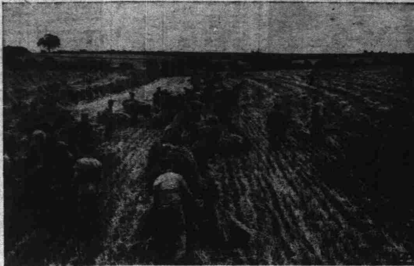
WILLING HARVEST HANDS — To aid English farmers short of harvest help, United States army men shock grain in a field somewhere in Britain's agricultural belt.