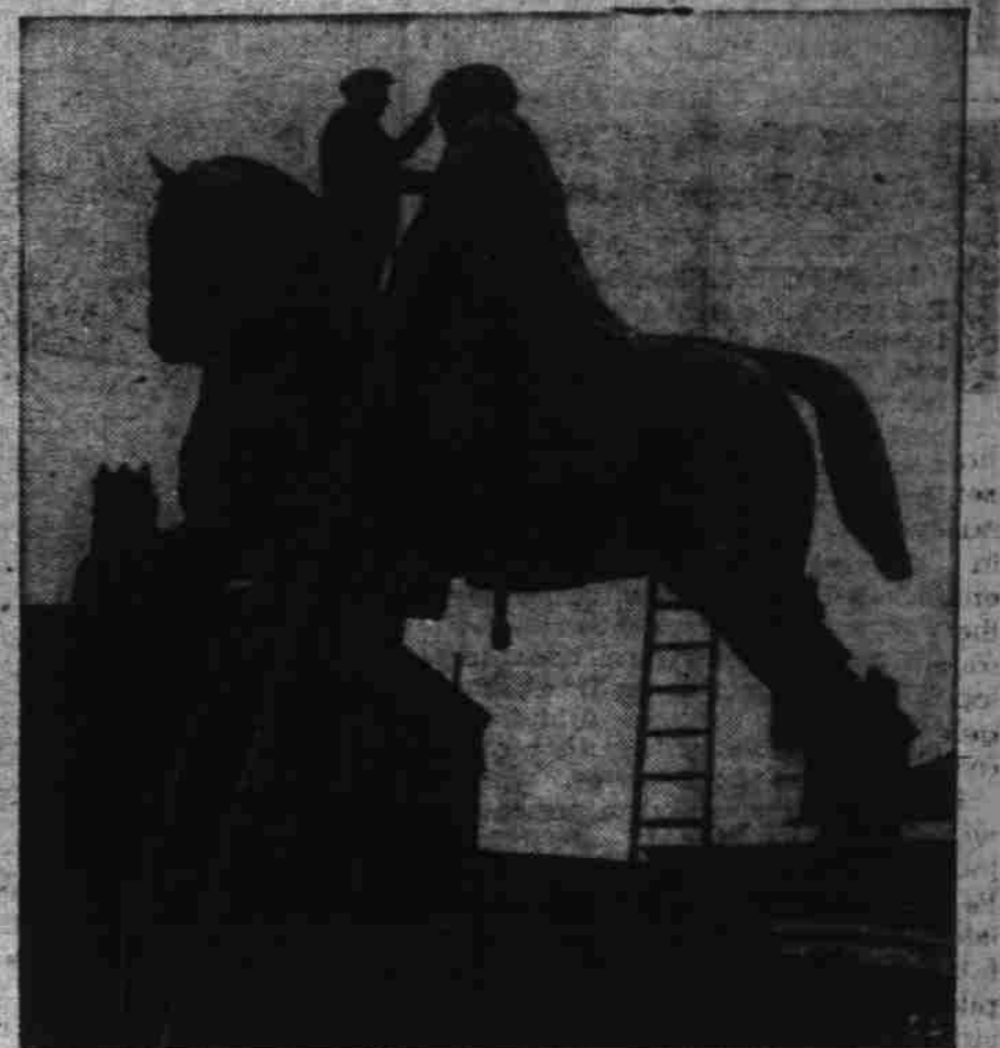
CLEANUP TIME—A workman from the British ministry of works and planning gives a periodical cleaning to the statue of the Earl of Haly in Whitehall, World War I monument, the design of which caused much controversy.