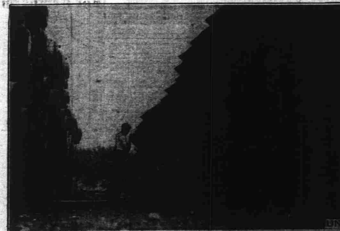
STACKED IN A "BOMB BANK" at an R.A.F. airfield in Britain, here are pictured some of the actual missiles which were among the 9,000 tons recently dropped in the devastating series of raids on the Nazi U-boat building base of Hamburg. The armors have the job of moving all these huge bombs to the Lancasters, Stirlings and Halifaxes dispersed around the field and there loading them up for rapid delivery. This "bank" is never out of "funds."