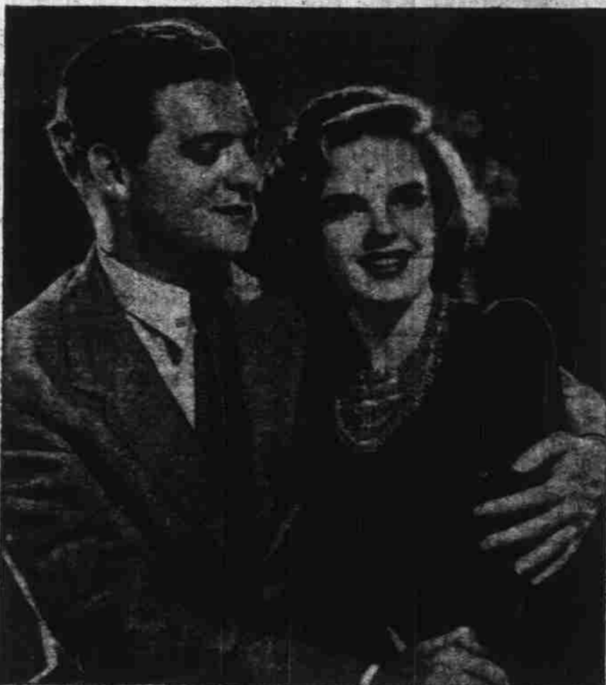
Judy Garland and Van Heflin in a joyous moment from M-G-M's musical romance, "Presenting Lily Mars," which starts Friday at the Elsinore theatre. Judy plays a stage-struck youngster who rises to stardom on Broadway. "Submarine Alert," an exciting drama of the sea during wartime, completes the double bill.