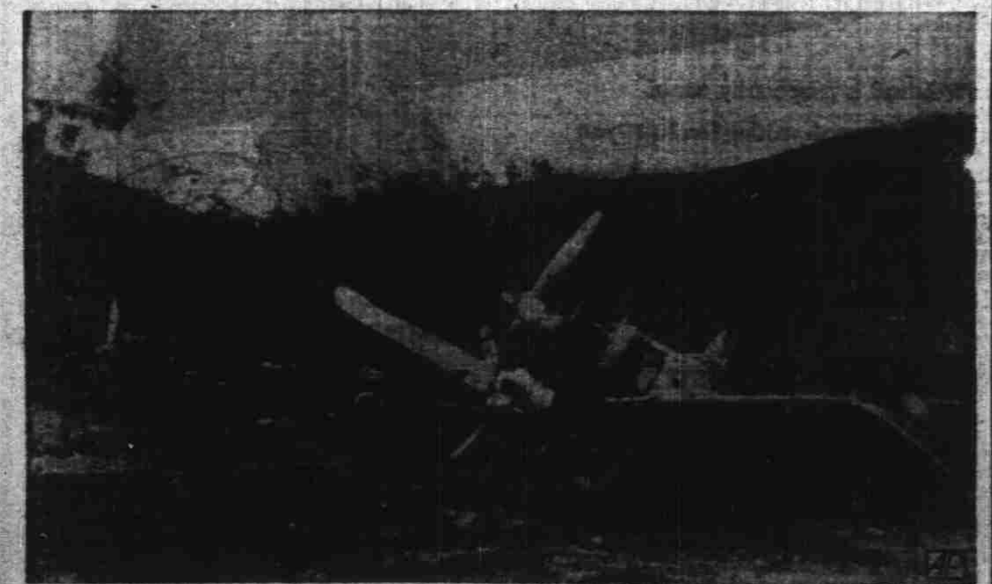
Members of American forces which captured Munda air field from the Japanese after a bitter struggle examine wrecked Jap fighters and bombers found on the field by the victorious Yanks.