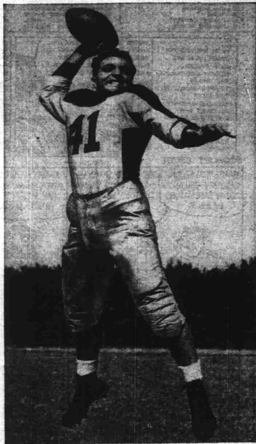
PITCHIN' PAUL GOVERNALL, former Columbia university All-American halfback, and counted upon to be a main cog in the college all-stars' lineup Wednesday night against the Washington Redskins, may see no action. Governall suffered an injured knee during a recent scrimmage.