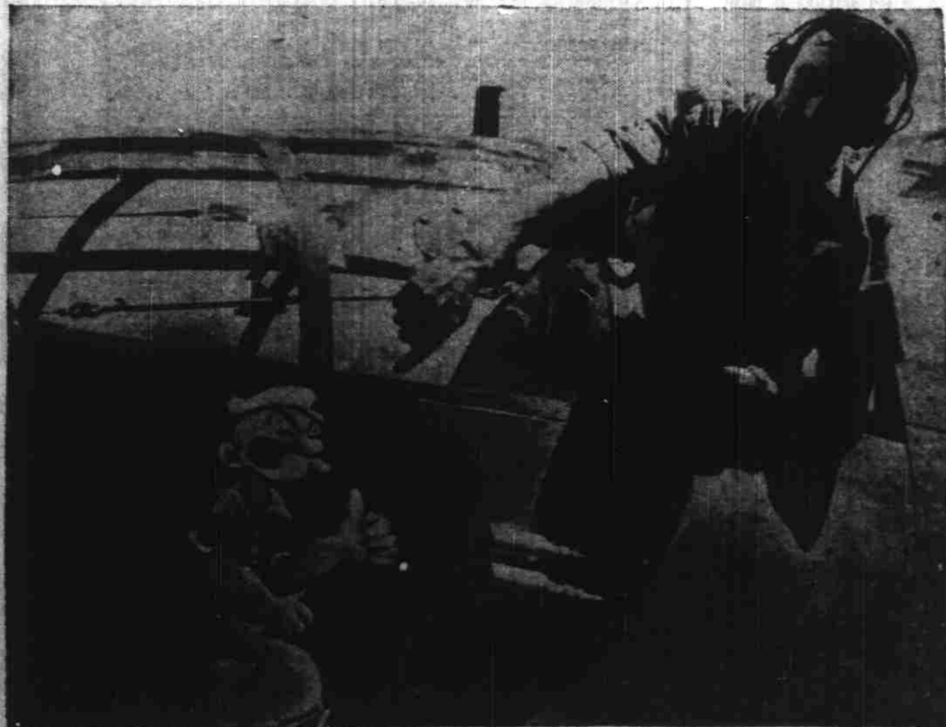
The Japs in the Dutch East Indies and nearby islands have a new enemy in their gunights—Popeye, the Sailor. He is a big twin-engined American Mitchell bomber used by Netherlands fliers based in Australia, with the brightly painted Popeye just alongside the bombardier's position. This particular plane has already been on many dangerous missions, bombing Japanese installations at Ambona, Kupang and other points. The Dutch squadron is composed of fliers who escaped from the Indies and a number of men trained at the huge Royal Netherlands flying school at Jackson, Miss. Its bombing missions usually entail long flights over shark-infested waters and deep jungles. Incidentally, the English pronunciation is used when discussing Popeye; no attempt at translation is made.