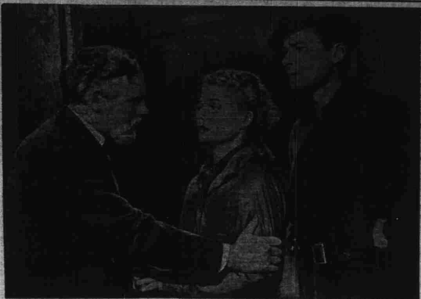
In a damp cellar of a farmhouse the Norwegian underground meet to thwart the Nazi overlords in Warner Bros. "Edge of Darkness." Karen Stenogard, Ann Sheridan, has just brought in a wounded comrade, while the village doctor, her father, played by Walter Huston, protests at her exposing herself to such danger. Gunnar Brogge, played by Errol Flynn, leader of the underground, loves Karen but believes that women have their part in the fight against Nazi tyranny. Under the personal supervision of Jack L. Warner, executive director for Warner Bros., "Edge of Darkness" tells a vivid story of the fight against Norway's "Gestapo." Completing the double bill now at the Capitol theatre is "United We Stand," official film of the United Nations as well as pictures captured from the axis. These two exceptional pictures are now playing at the Capitol.