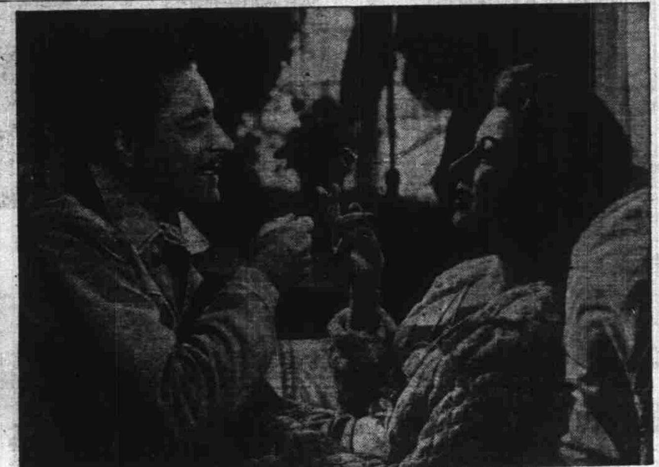
To link two hearts—That is the small loving gift that penniless Smithy (Ronald Colman) gives to his wife, Paula (Greer Garson), after their baby is born in "Random Harvest." Their co-starring film is adapted from James Hilton's best-selling novel, which starts today at the Capitol theatre.