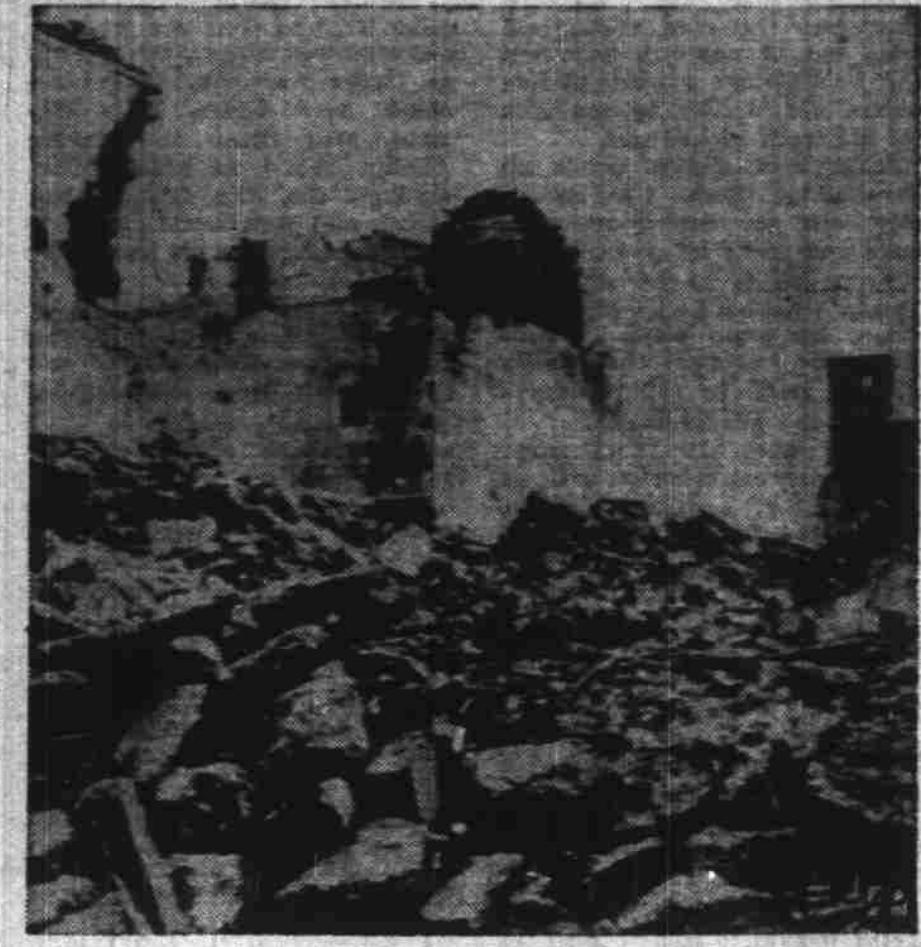
Stark ruin wrought by allied airmen in the incessant bombing of the Italian island fortress of Pantelleria greets the eyes of the invaders.