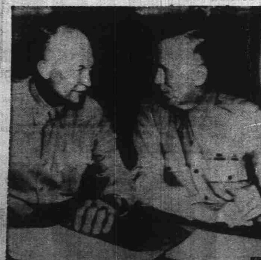
It might be problems of war that command the attention of Gen. Dwight D. Eisenhower, allied commander-in-chief (left), and Gen. George C. Marshall, chief of staff of the US army, as they chat during an informal press conference in Algiers. Gen. Marshall accompanied Prime Minister Churchill to North Africa on his return to London from conferences with President Roosevelt in Washington.