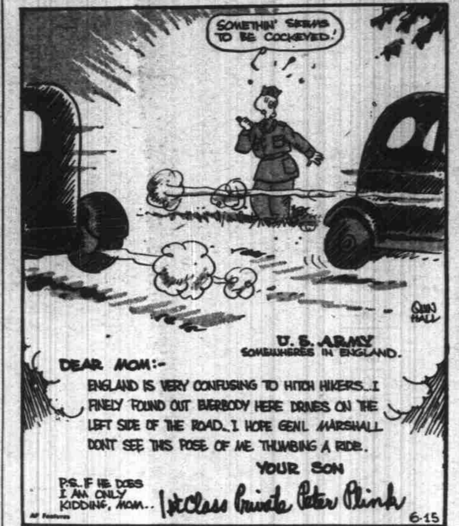
U. S. ARMY SCHEDULES IN ENGLAND. DEAR MOM: ENGLAND IS VERY CONFUSING TO HITCH HIKERS... I FINELY FOUND OUT BARBDOY HERE DRIVES ON THE LEFT SIDE OF THE ROAD... I HOPE GENL. MARSHALL DON'T SEE THIS POSE OF ME THUMBING A RIDE. YOUR SON