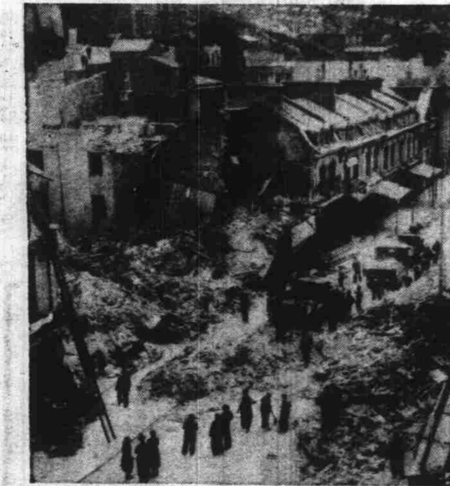
This wreckage in a row of shops in a southwestern English coastal town was caused by a German air raid which also smashed a church, killing 15 children and three Sunday school teachers.