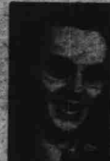
Joseph Hemann Men's Furnishings