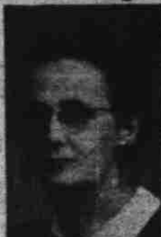
Vera Magee Ready-to-Wear