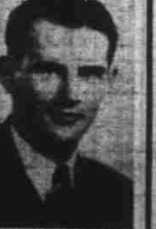
Laddie Stanley Men's Furnishings