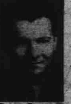
Brute Cooper Work Clothes Dept.