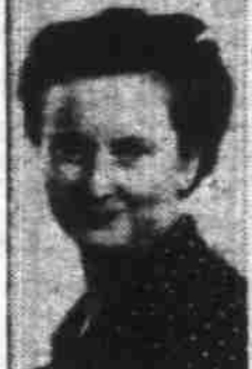
Neola Wirth Girls' Dept.