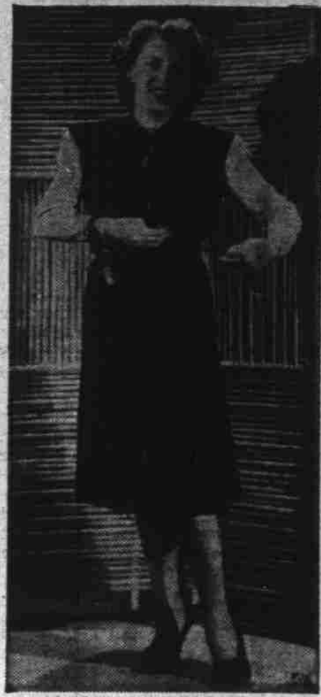
JUST TIE IT —No priority hooks, snaps, buttons or zippers make this New York creation one of the most patriotic of dresses. It simply ties at throat and sides.