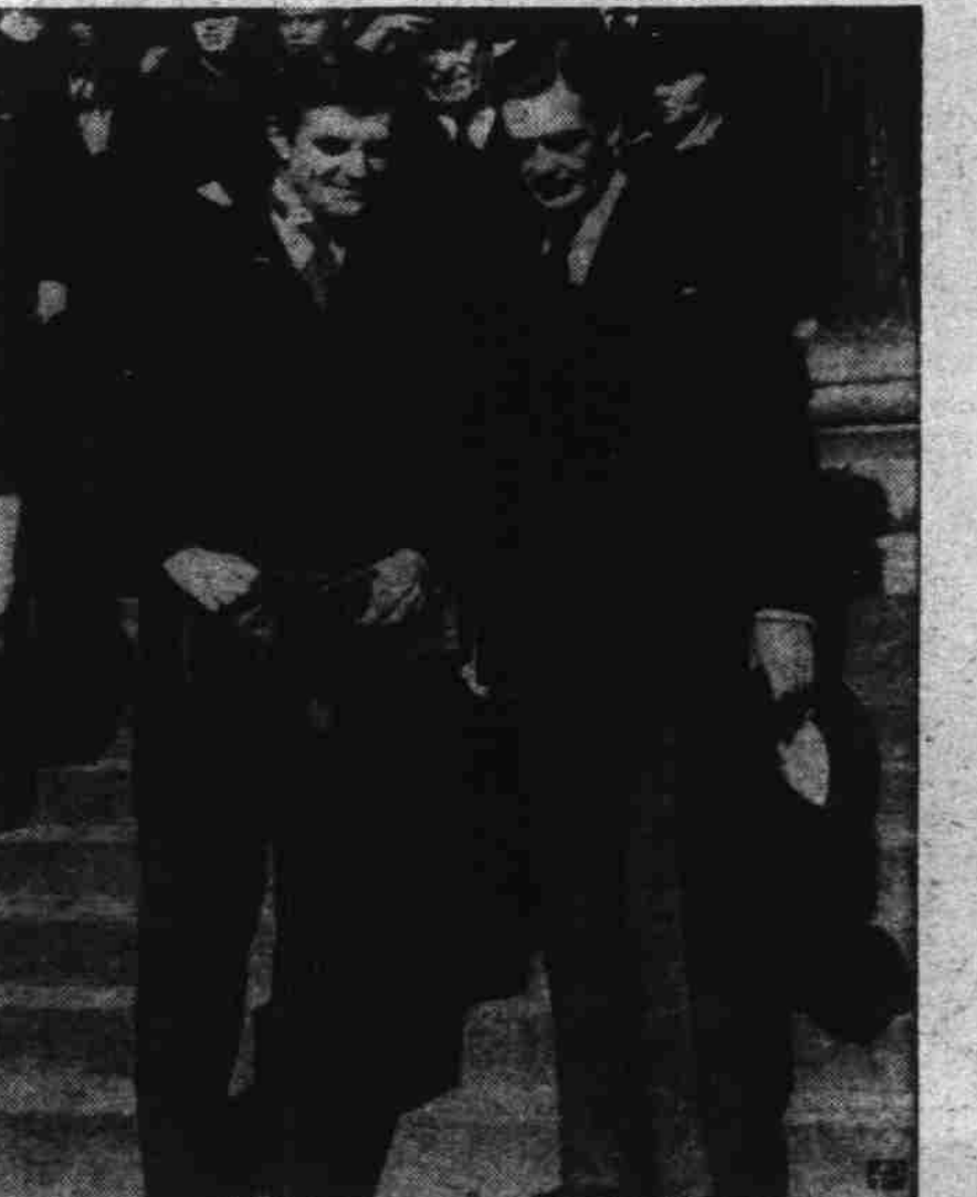
DIPLOMATIC EXCHANGE —James G. Wainwright (left), U. S. envoy to Britain, and Foreign Secretary Anthony Eden chat at London thanksgiving service for North African victory.