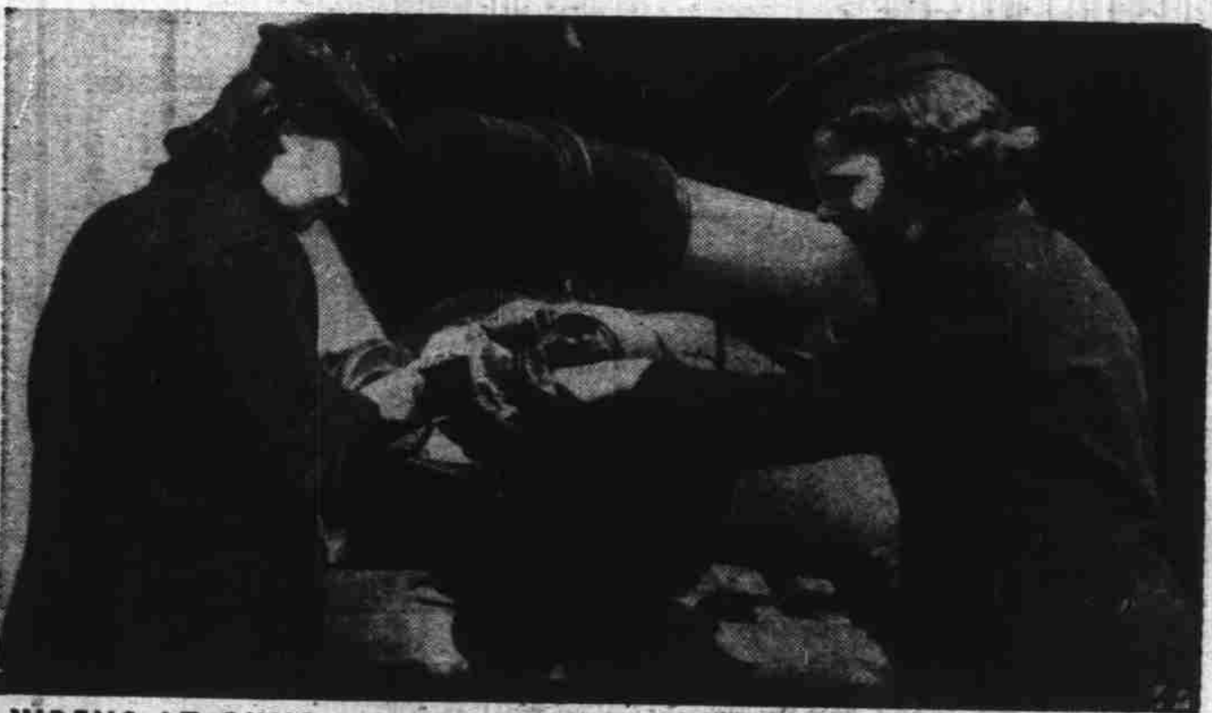
WRENS AT GUNS —Qualified in ordnance work, these members of the Wrens assemble the breech of a four-inch gun on board a corvette at an unnamed British port.