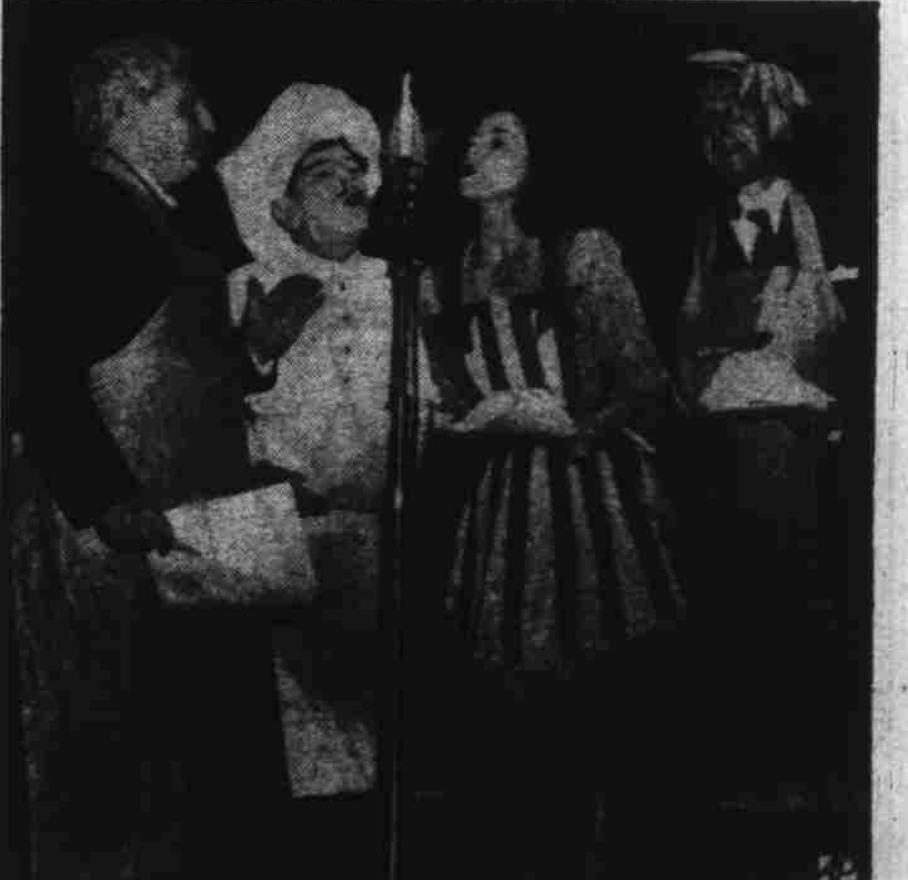
RAGGING RIGOLETTO — The famous quartet from Rigoletto got a real going over when these celebrities performed it on a Stage Door Canteen program. (Left to right): Giovanni Martinelli, Willie Howard, Carol Bruce and Walter Hampden.