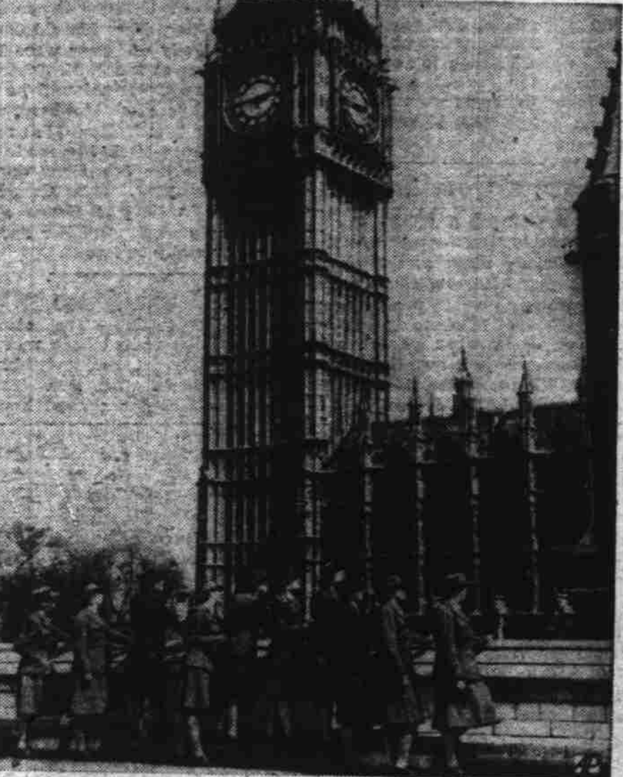
WAACS GO SIGHT-SEEING —A group of American WAACS, among the first to arrive in England, look over London's Houses of Parliament on a sight-seeing tour while off duty. Famed Big Ben appears in the background.