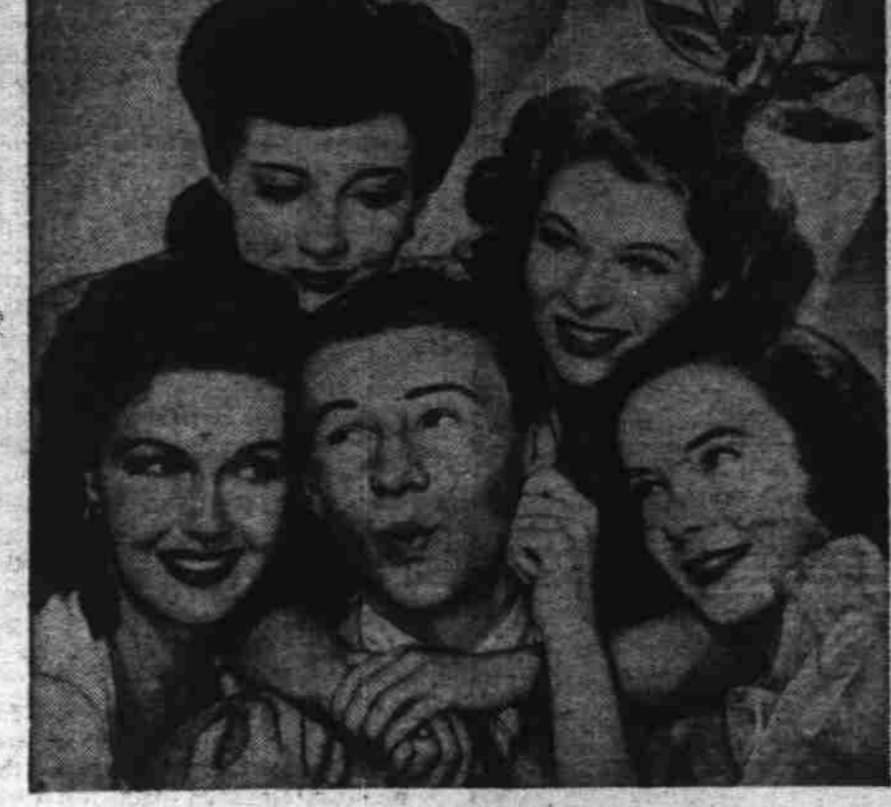
Henry Aldrich in a new role and he loves it! He's the center of attraction in his new Paramount comedy, "Henry Aldrich Gets Glamour," now at the Elsinore theatre, with Jimmy Lyden as Henry, and Charles Smith, John Litel, Olive Blakeney, Diana Lynn, Frances Gifford and Vaughan Glaser. Above, Frances Gifford and Diana Lynn on either side of the glamour boy, Gail Russell and Ann Rooney looking down on him. Co-featured with the new Lana Turner hit "Slightly Dangerous."