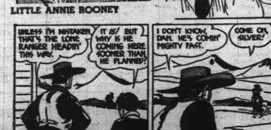
THE LONE RANGER