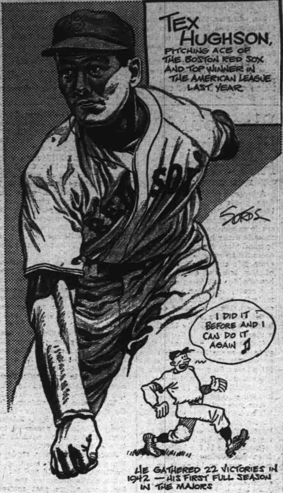
TEX HUGHSON, PITCHING ACE OF THE BOSTON RED SOX AND TOP WINNER IN THE AMERICAN LEAGUE LAST YEAR.

I DID IT BEFORE AND I CAN DO IT AGAIN! HE GATHERED 22 VICTORIES IN 1942—HIS FIRST FULL SEASON IN THE MAJORS