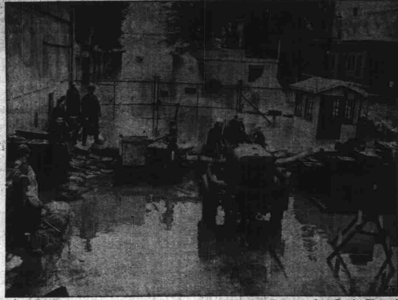
Three coast guardsmen operate an auxiliary pumper at the R. G. LeTourneau plant, Peoria, Ill., enabl ing continued work on war contracts. Sprays of water from the pump can been seen in the background. The rising flood of the Illinois river threatened several industrial units at Peorla,