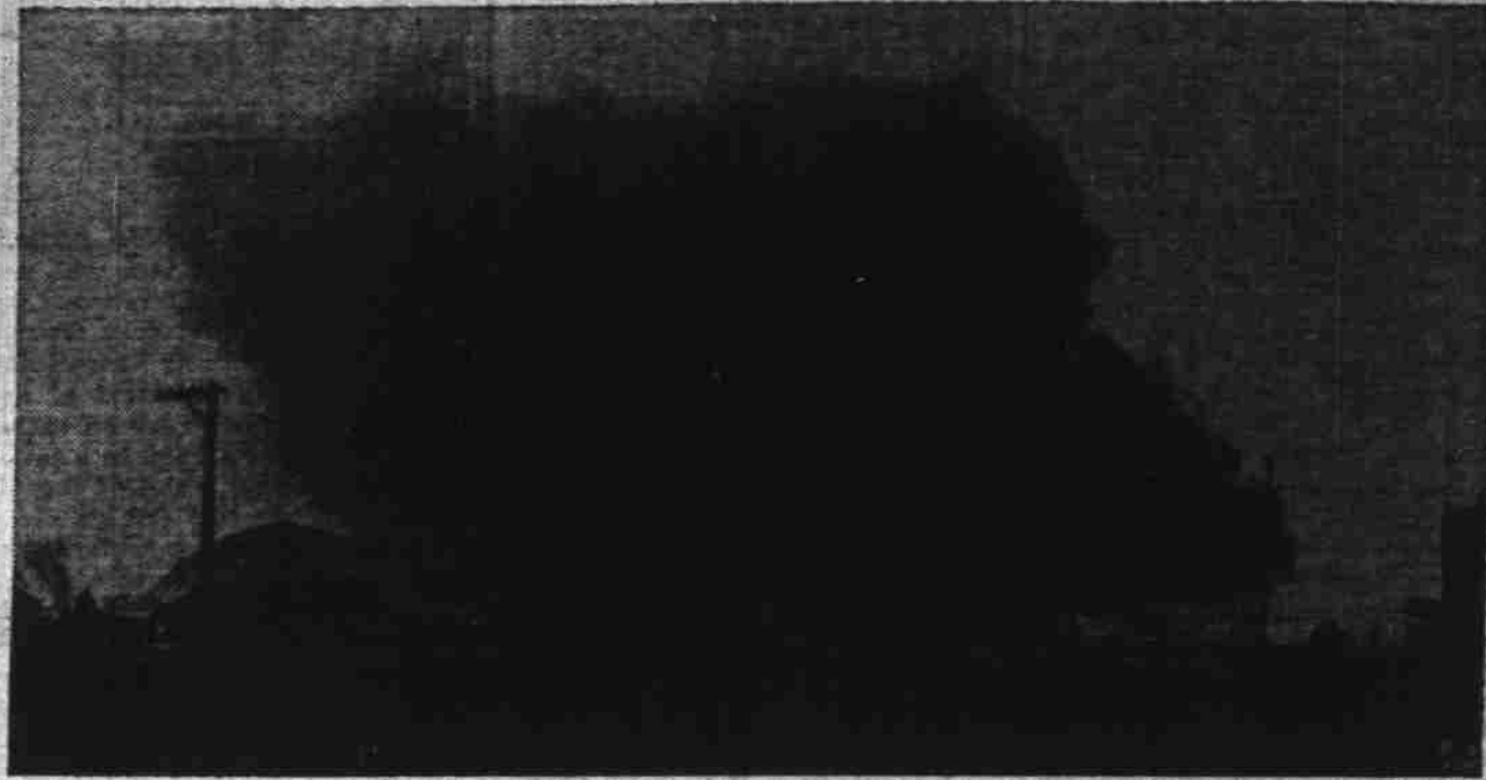
Smoke rolls from a big illuminating gas tank on Chicago's southeast side, after a huge army bomber crashed into it with a terrific impact. Fragments were scattered over the surrounding prairie. Firemen said they believed that the 12 persons in the plane died. Note smashed part of tank on ground at left and firemen pouring water at right.