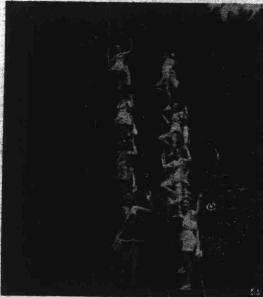
ORANGE PICKERS —High school girls of Duarte, Calif., wave a greeting from high ledges as they pick oranges from a giant, 67-year-old seedling orange tree, largest in California. The big tree stands 34 feet high.