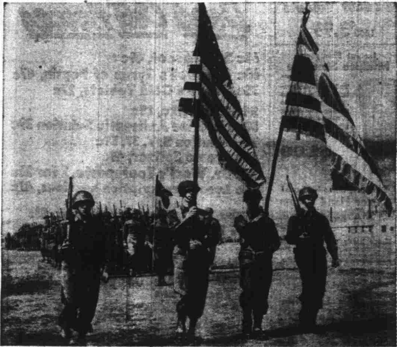
TWO FLAGS, ONE PURPOSE —American and Greek flags are carried by the color guard as the U. S. Army's all-Greek infantry battalion parades at Camp Carson, Colorado Springs.