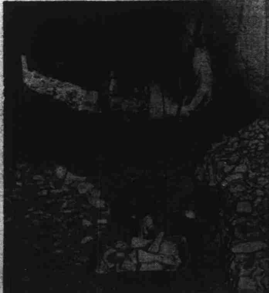
CUTTING THROUGH SOLID ROCK , workmen dig new quarters for the R.A.F. on Malta, British island fortress in the Mediterranean. The island is honeycombed with such dugouts, protecting the inhabitants and English defenders from the constant bombings.