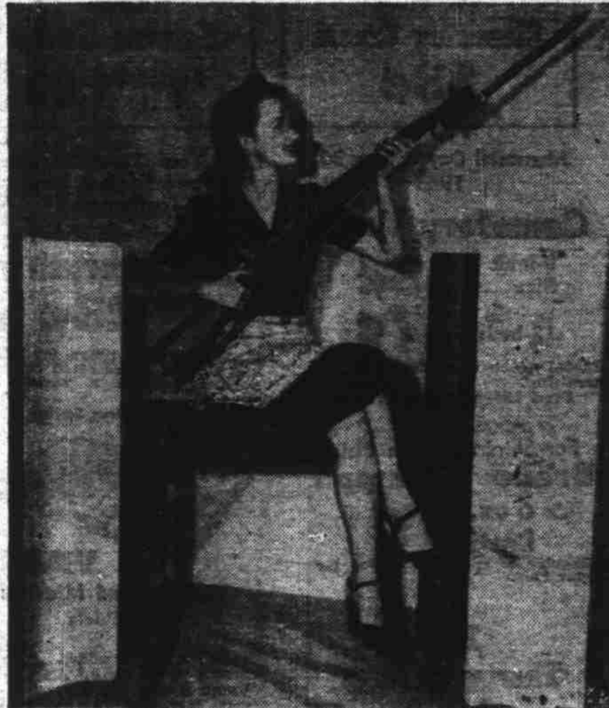
REPLACEMENT FOR METAL —Use of pressed wood to make the light reflectors at left and right above saves enough metal to make the Garand rifle displayed by the pretty model. The reflectors are used in industrial plants.