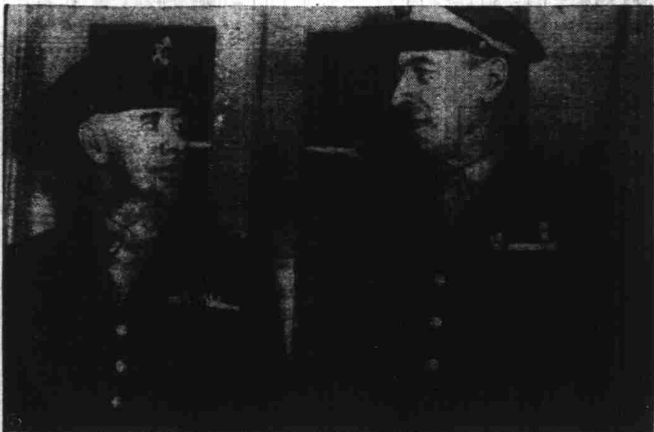
"FIRST STRING TEAM" OF JAP FLYERS is gone already, Lieut. Gen. George C. Kenney, left above, Allied air chief in the Southwest Pacific, declares as he visits Washington to report on Gen. Douglas MacArthur's operations in that area. He is pictured with Maj. Gen. Richard K. Sutherland, General MacArthur's chief of staff, as they left the White House after a conference.