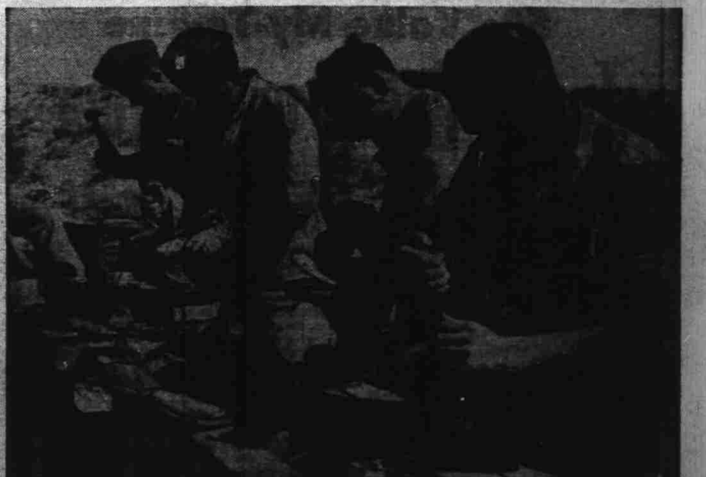
DESERT COBBLERS —Hard at work in the desert repairing shoes worn out in pursuit of retreating Axis armies are these cobblers of the British Eighth Army.