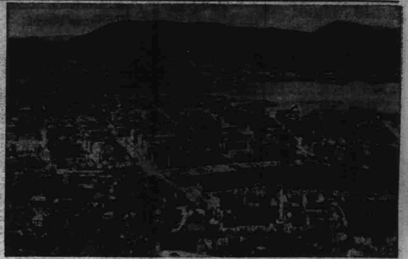
INVASION POINT? —Bergen, important shipping city on Norway's west coast, shown here in a peacetime panorama, is often mentioned as an Allied invasion point.