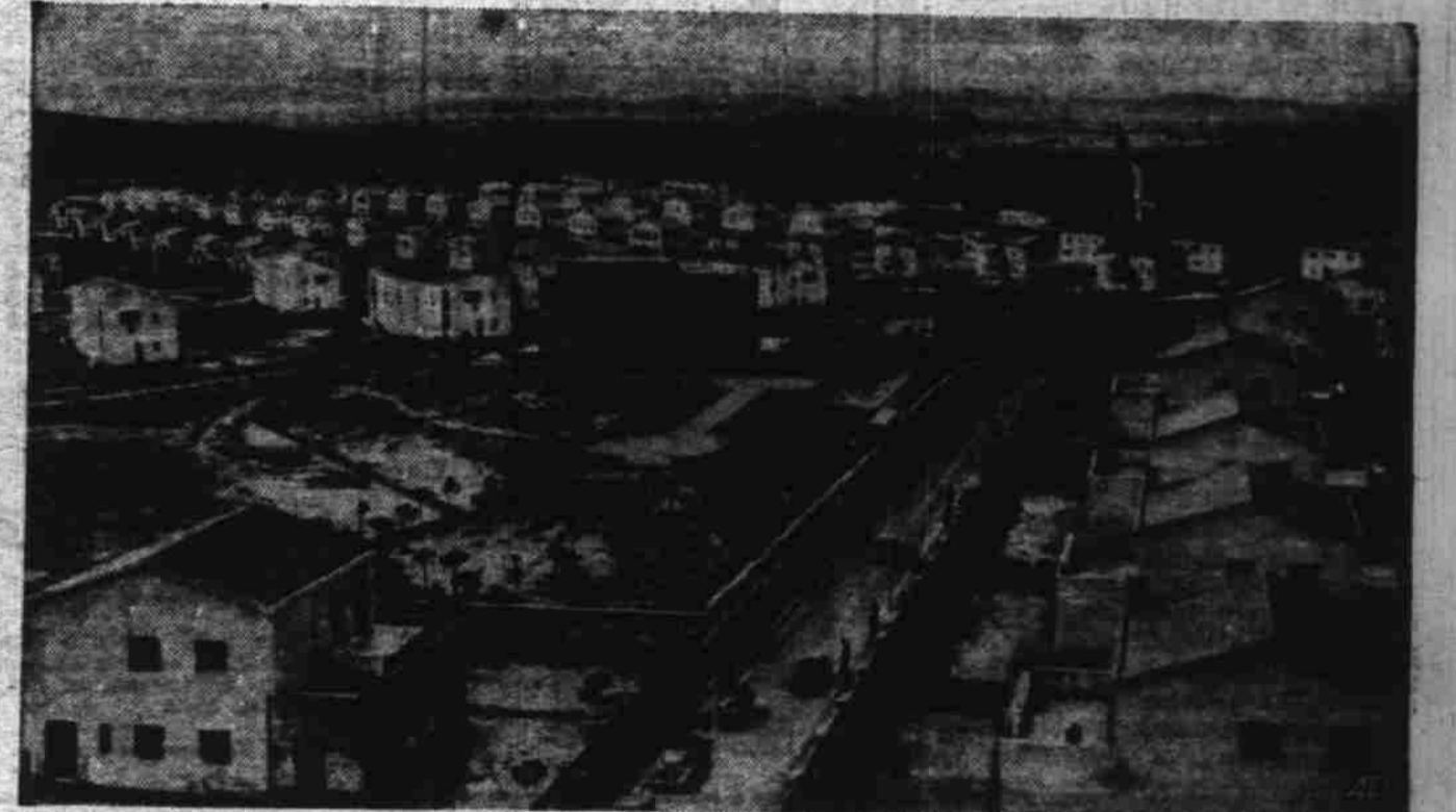
MUSSOLINI'S CITY OF COAL —A certain objective should the Allies invade Sardinia is Carbonia, shown here at its dedication by Mussolini as his "city of coal."