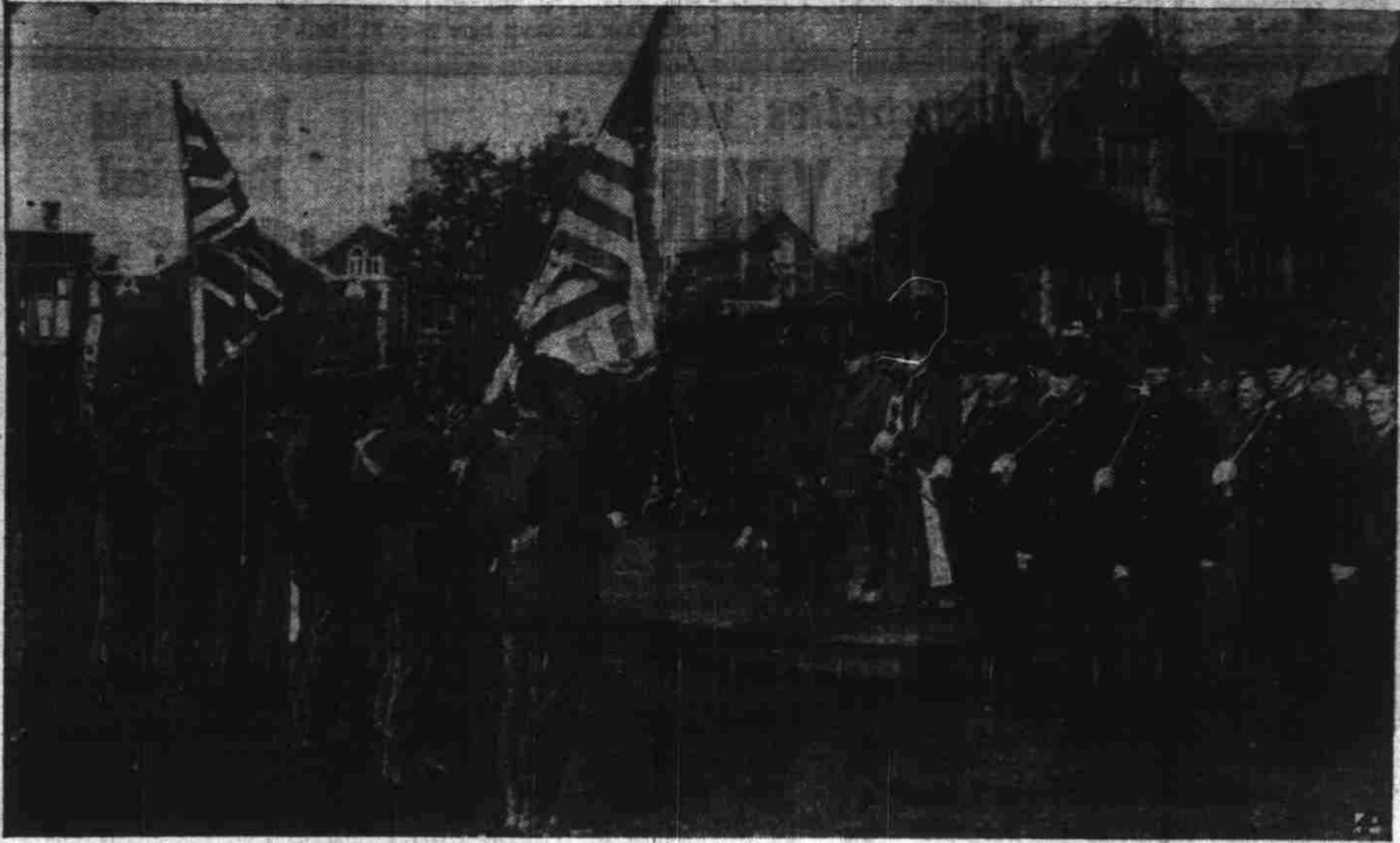
BRISTOL, ENGLAND, HONORS BRISTOL, U. S. A. —American soldiers who name "Bristol" U. S. A. as their homes stand beside Home Guards of Bristol, England, for an exchange of flags ceremony at which the English city was host to the Yanks.