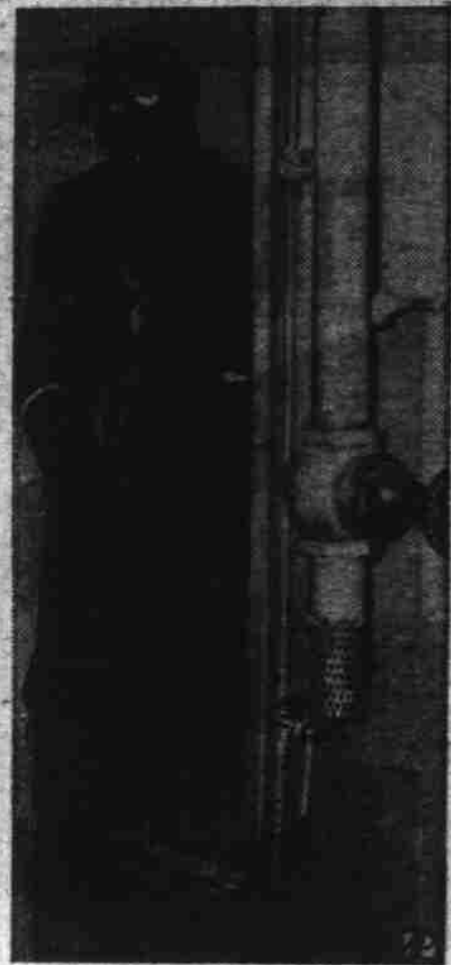
'MARTIAN' —Carbed like a man from Mars, this General Electric engineering expert is about to step into a sub-zero chamber to test the effect of cold on radio equipment.