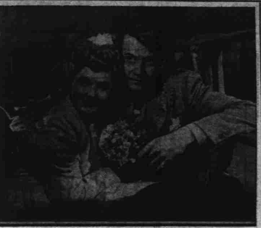
After a hectic week of sharing her tiny apartment with Joel McCrea and Charles Coburn, Jean Arthur finds herself alone with McCrea in this romantic scene from George Stevens' comedy, "The More the Merrier. Opens Saturday at the Elsinore.