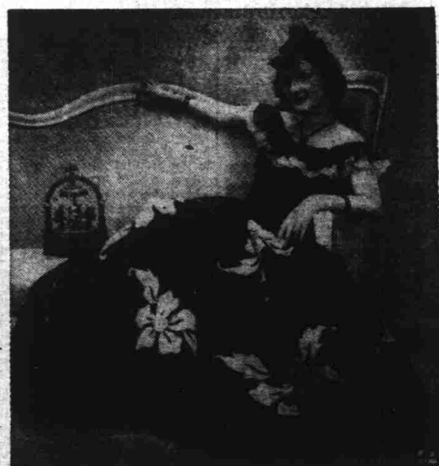
DAINTY AND DEMURE. —Dorothy Stickney, Broadway star, wears an evening dress with off-the-shoulder neckline, a New York creation of black mousseline de soie. The gadget beside her is an old European music box, one of her collection of music boxes from all parts of the world.