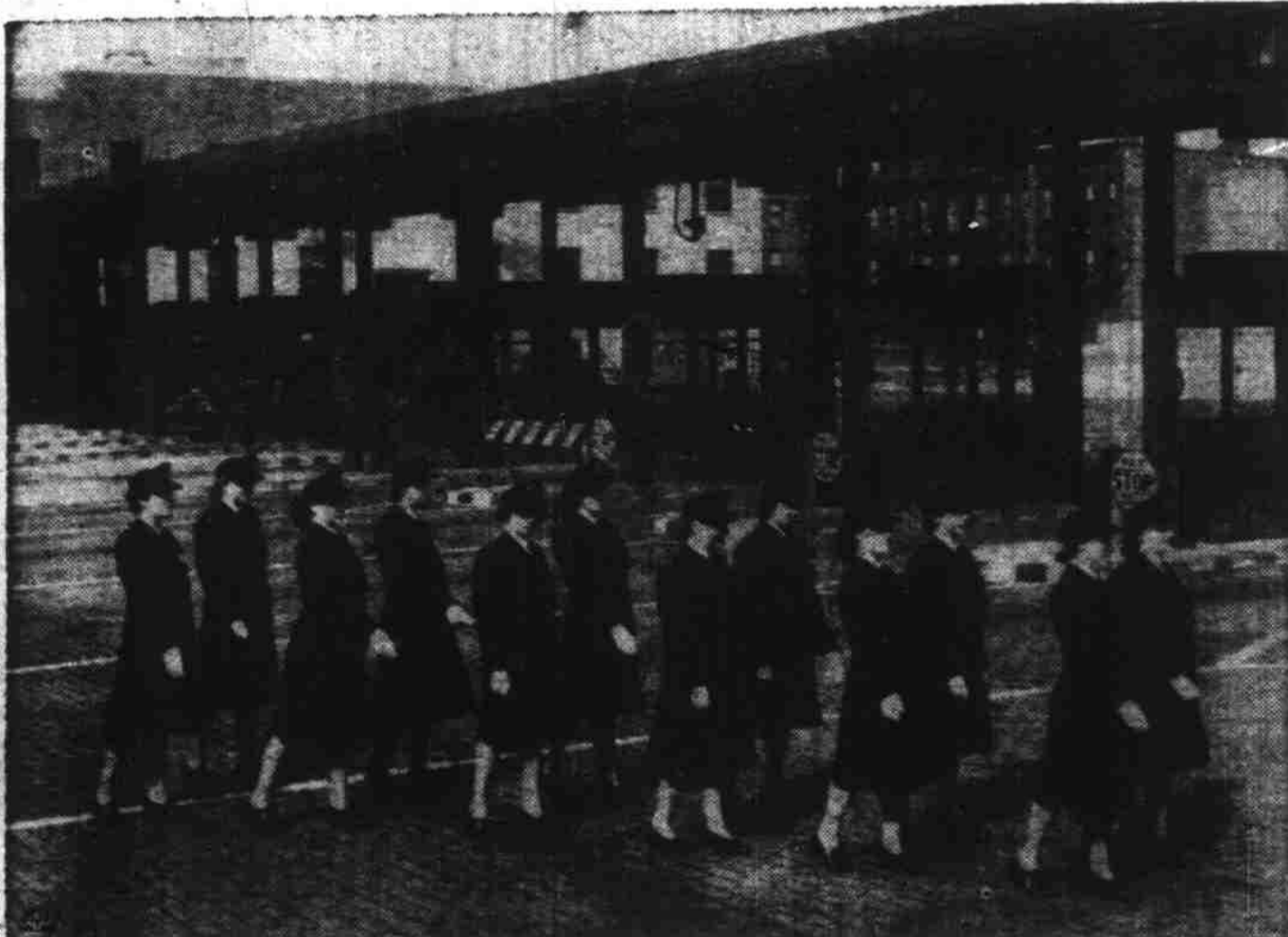
GIRLS FOR TUNNEL OFFICERS. —Newly appointed women tunnel officers, replacing men in defense jobs or the army, march to work at the Queens midtown tunnel, New York City.