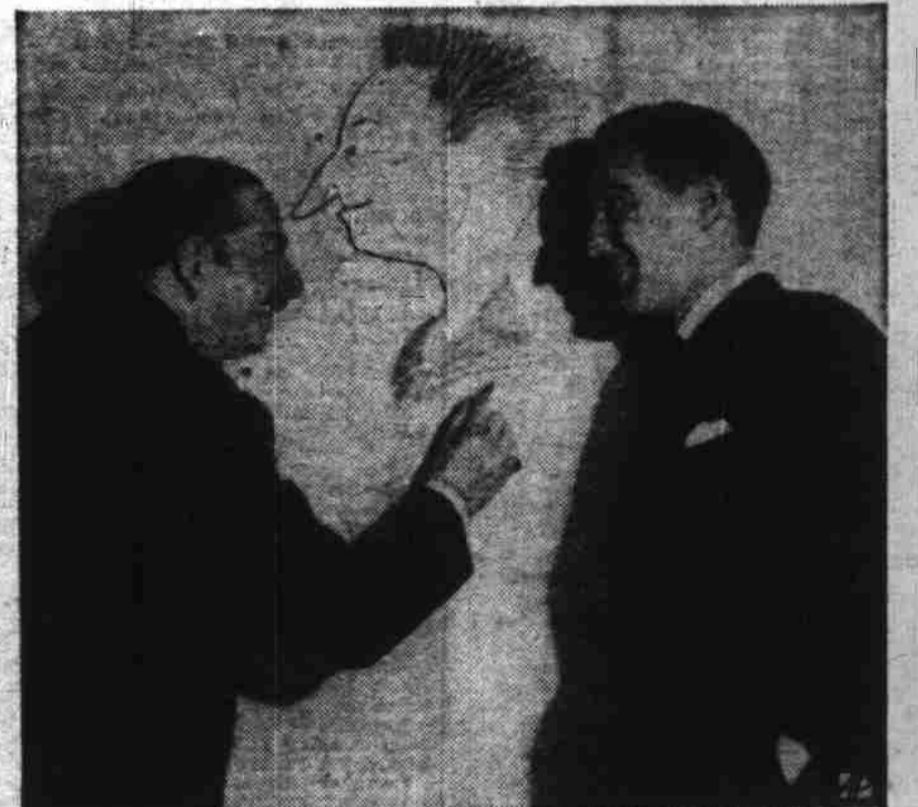
ARTISTIC MAESTRO. —Xavier Cugat, known for his rumba music, demonstrates another of his talents with a caricature of Comedian Garry Moore. The maestro has caricatured numerous celebrities, including himself.