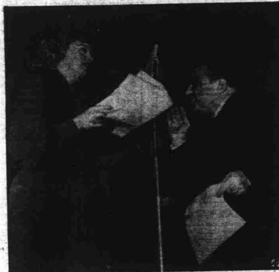
MAYORAL CHIT-CHAT. —New York's Mayor F. H. LaGuardia engages in conversational pleasantries with Singer Jeanette MacDonald at a Stage Door Canteen broadcast.