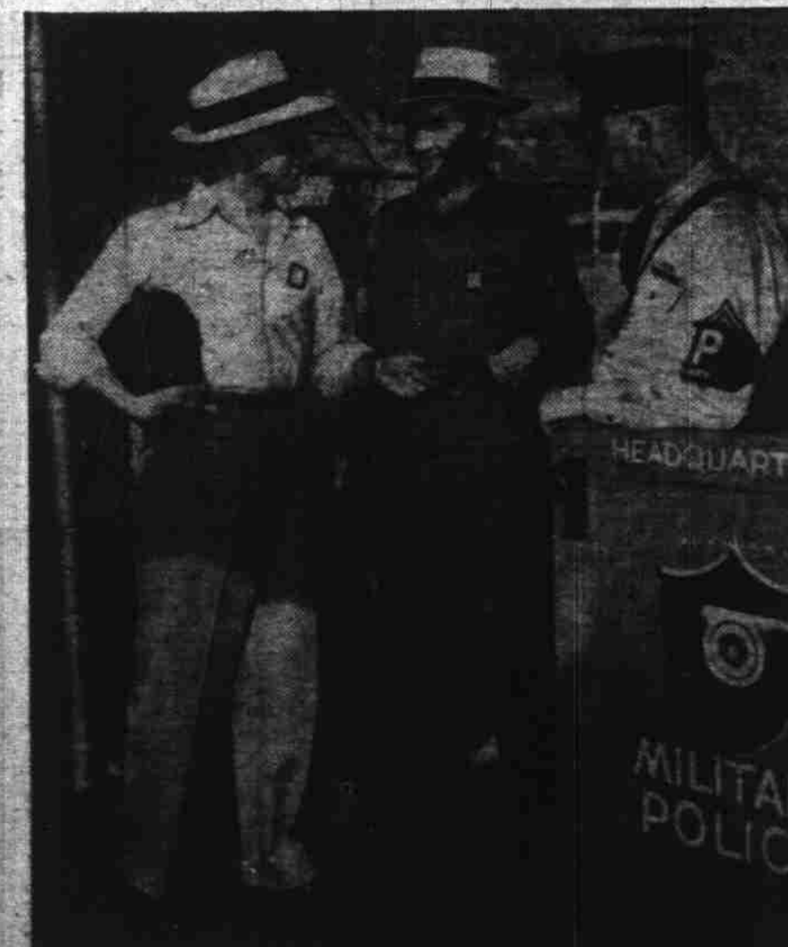
WELL-DRESSED WORKERS. —What the well-dressed war worker is wearing, as soon as a great crowd pined. The worker at left wears gabardine slacks, the man at right a cotton twill ensemble, while both sport Panama hats.