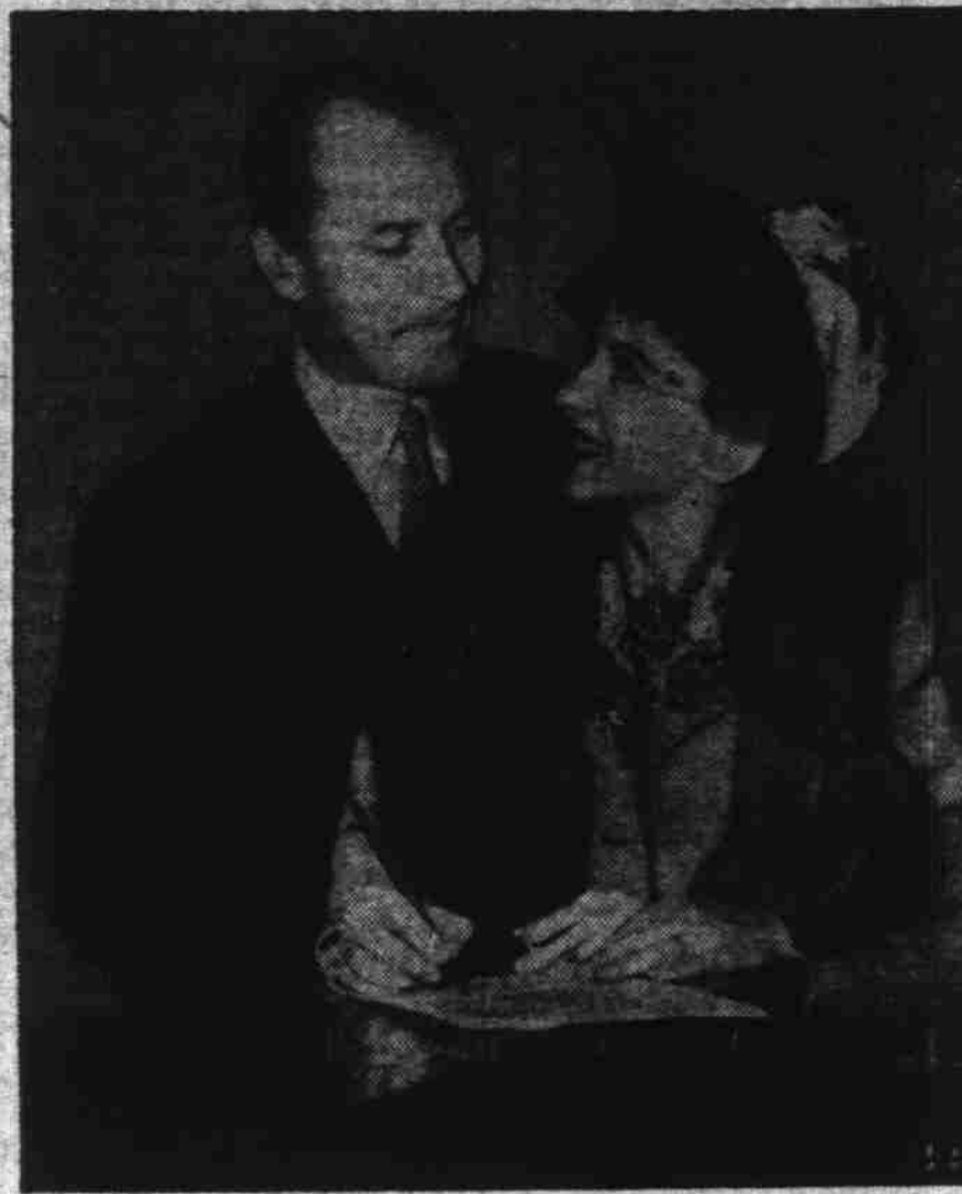
ACTRESS BECOMES CITIZEN. —Motion Picture Star Joan Fontaine signs paper on becoming a United States citizen while her husband, Actor Brian Aherne looks on. Miss Fontaine was born in Tokyo of British parents.