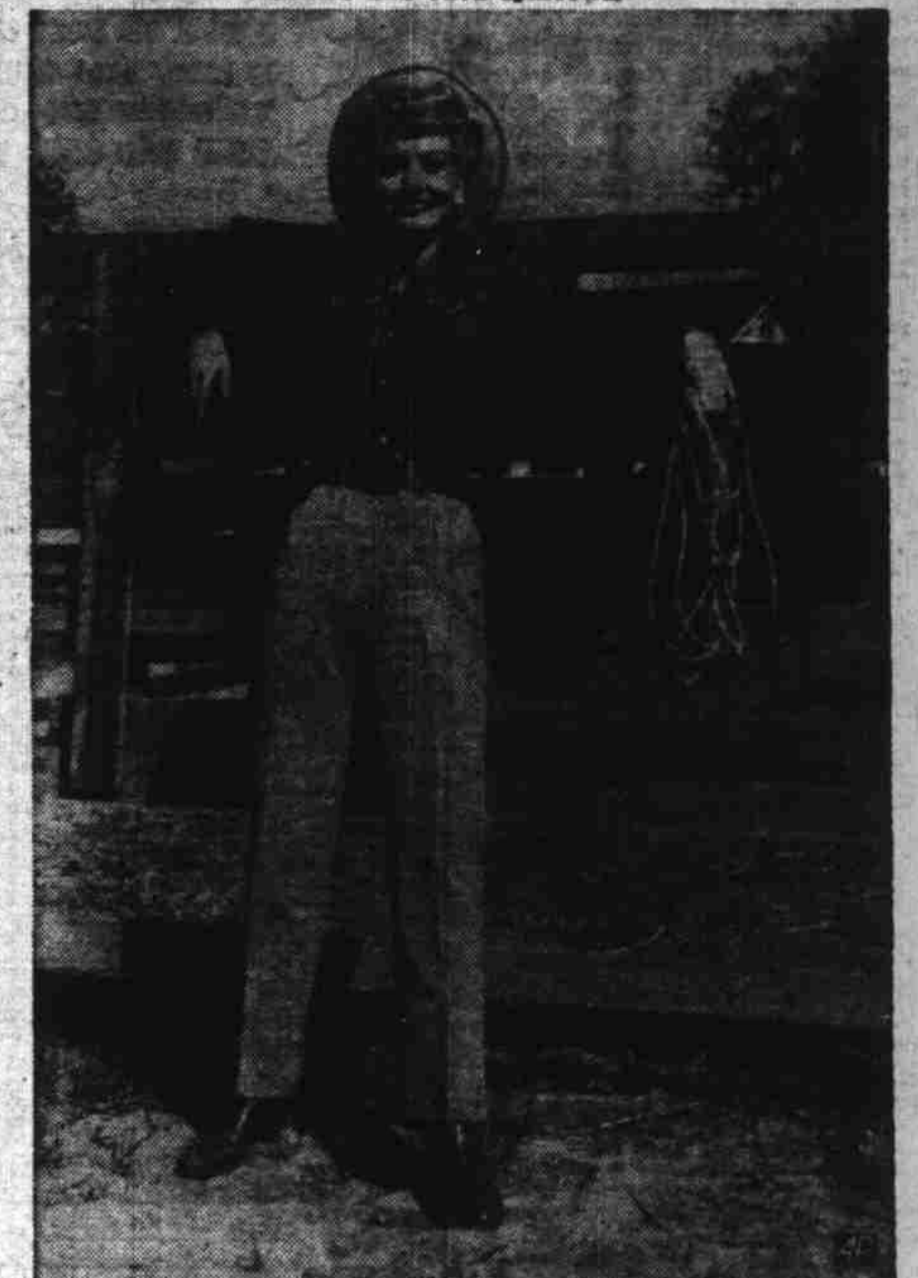
FOR COUNTRY LIVING. —Motion Picture Player Ann Savage models a smart western costume for riding and outdoor work in the country. The pants are of beige twill and the shirt is red with narrow piping in white.