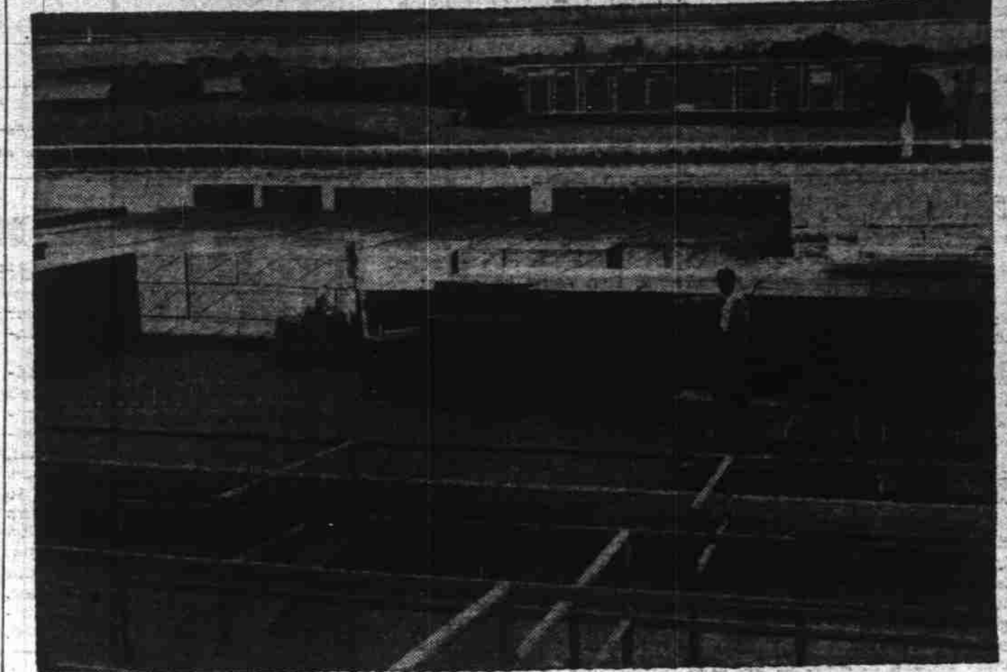
Hollywood Park, one of the nation's most beautiful palaces of turfdom, has joined the war effort. The fashionable track, where, in pre-war days tens of thousands of fans cheered the winning efforts of Seabiscuit, Chelchelden and other greats, has been leased by the North American Aircraft corporation. The photo shows crated airplanes where once rich and poor alike rubbed elbows watching the "Sport of Kings."