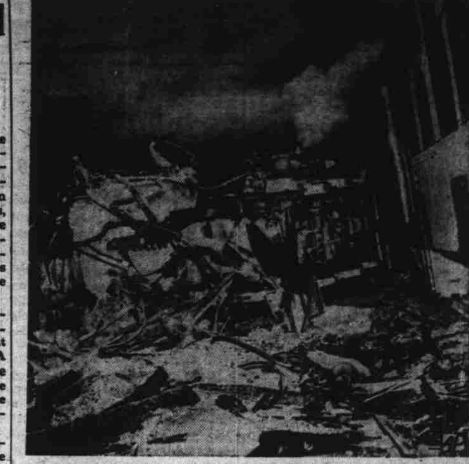
An Indianapolis union railway locomotive (left) lies on its side after a collision with a Big Four passenger train at a crossing in Indianapolis, Ind. Four railway employees were killed. None of the passengers on the Big Four train was hurt.