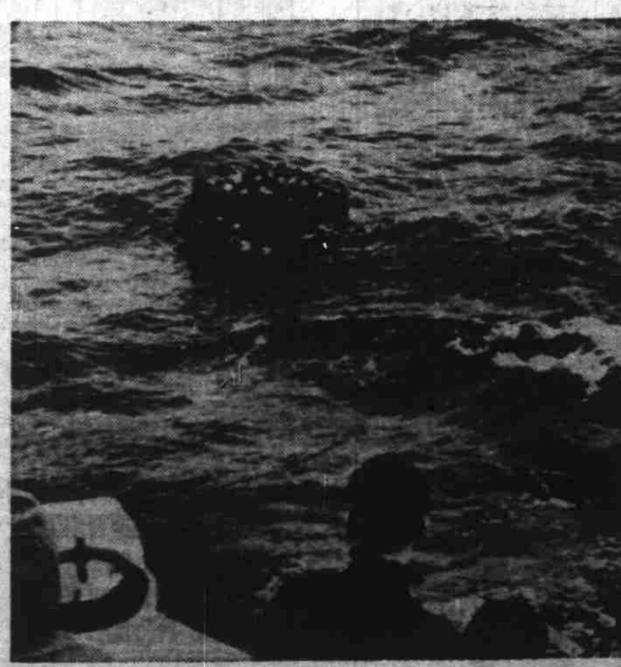
Near exhaustion after many days afloat, these 16 men crowded onto a single life raft were found drifting in the north Atlantic by a US coast guard cutter. Guardsmen in foreground stand ready for rescue as the cutter maneuvers into position. The seamen were cast adrift when their ship was torpedoed by a German submarine.