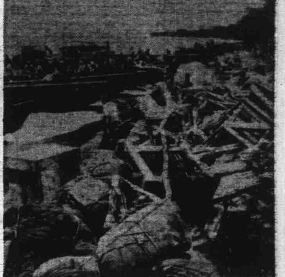
Crates and tarpaulin-covered packages are dumped on the narrow beach at Guadalcanal, the Solomon, from lighters...