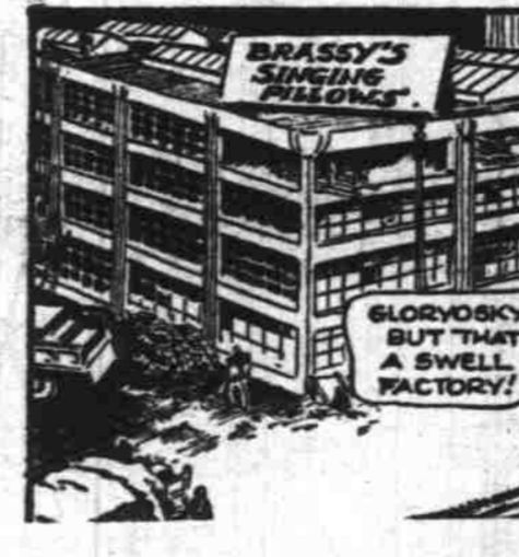
LITTLE ANNE ROONEY