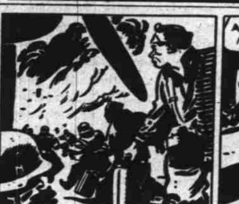
BY JEEPEERS!! IF I KETCH TH' COFF AN' WHEEZES I'LL SUE TH' WHOR DEPARTMENT