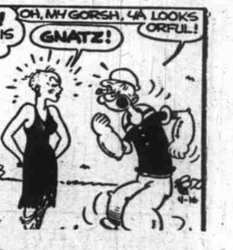
OH, MY GORSH, YA LOOKS ORFUL!