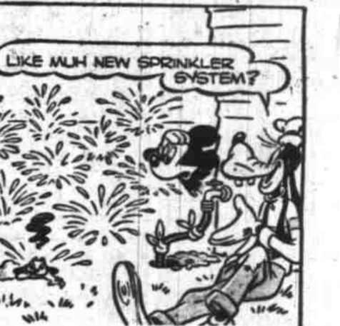
OH, MY GORSH, YA LOOKS ORFUL!