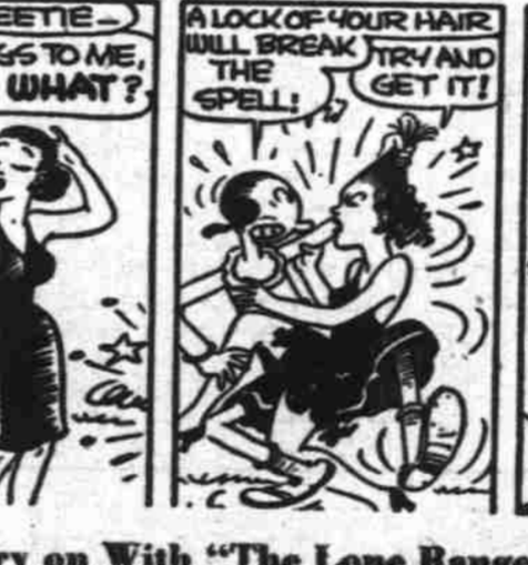
Carry on With "The Lone Ranger." Full Page Every Sunday.