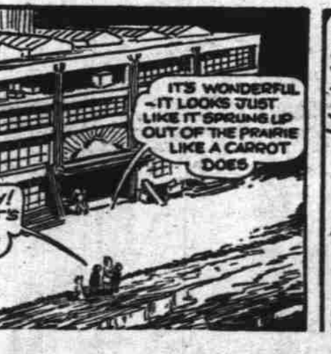
Don't Miss "Flash Gordon." Full Page in Color Every Sunday.