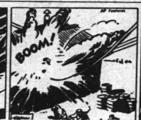
Read "Prince Valiant" and "Flash Gordon." Full Pages in Color Sunday.