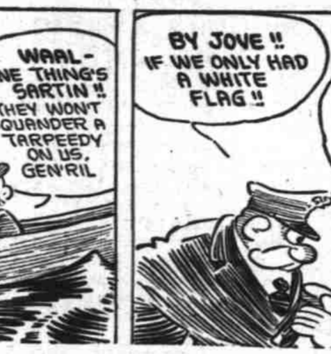
Meet "Freddie" and His Friends Right Around Home. Full Page in Color Sunday.