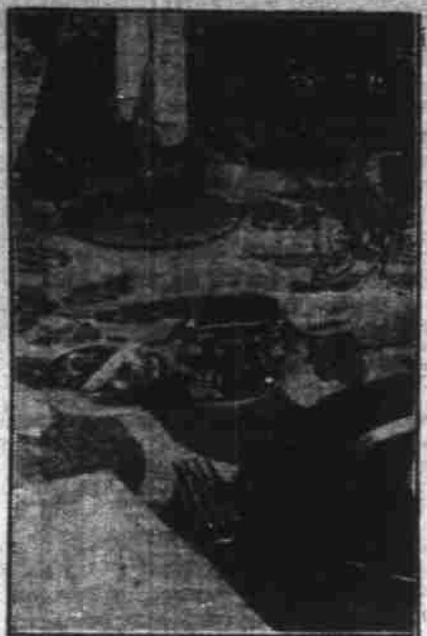
SAVE MATCHES! Be prepared with an automatic lighter like this crown-shaped model.

Before the war almost 10 per cent of the British national income was distributed in the form of social services.