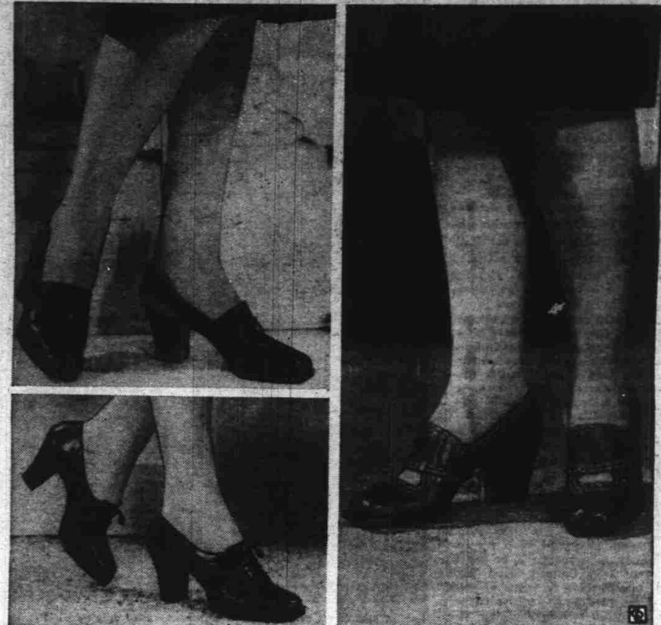
Top left, sandal with nailhead detail; below, calfkin oxfords; right, tailored walking shoe. This season you will want to get shoes that will wear long, feel comfortable and look smart with most costumes. This will mean that your three pairs will need to be fine shoes, as enduring in their fashion appeal as in their intrinsic quality. The three pairs shown are all Delman designs and strike just the right casual note—smart enough to go with summer dresses and suits. The sandal, top left, is made with an open-back and with metal nailheads in design on sabot and bordering the platform of the heel. It is unlined and made of polished calfskin. Below is a pair of oxford of unlined polished antique calfskin with leather heel and tailored extended sole. Right is a pair of sabot tailored walking shoes in the same kind of leather, with natural hand-glove double stitching as outline trim.

Your New Shoes Should Be Smart, Comfortable