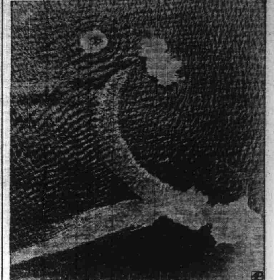
An already damaged Jap destroyer tries unsuccessfully to dodge bombs bursting at her bow during the battle of the Bismarck sea, leaving a long oil slick (left) in her wake.