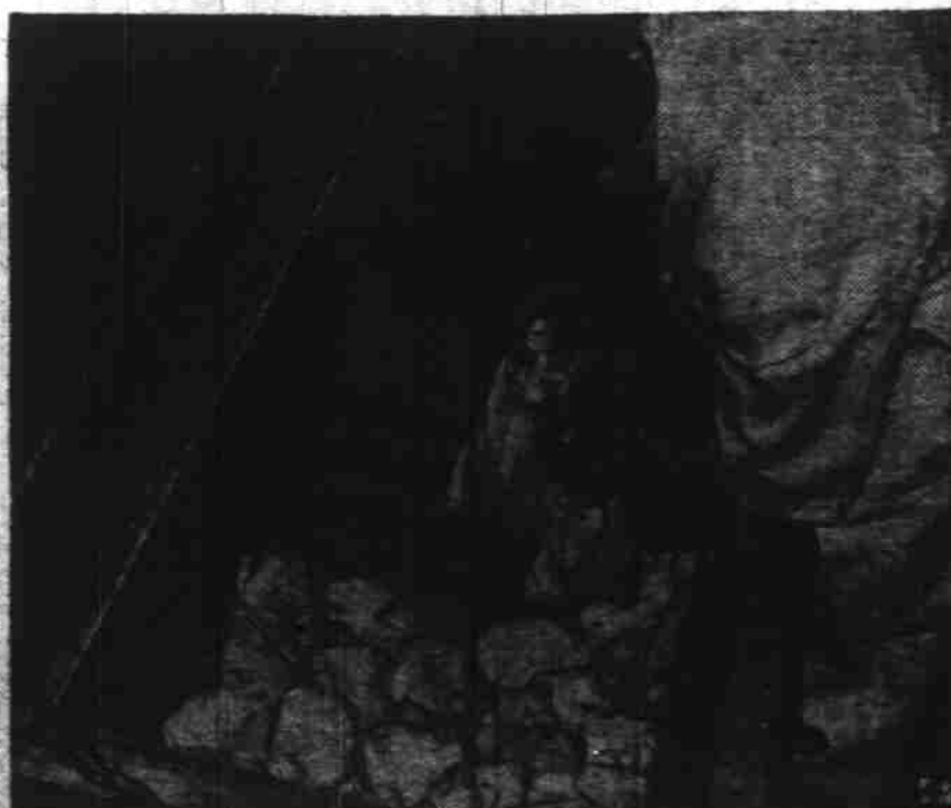
BLOOD FOR BATTLE LINES —An attendant leads one of the refrigerated Church containers used to ship blood donations to the laboratories where it is processed into plasma for treating casualties in the U. S. armed forces. The containers prevent changes in temperature, thus facilitating Red Cross program for 4,000,000 donations this year.