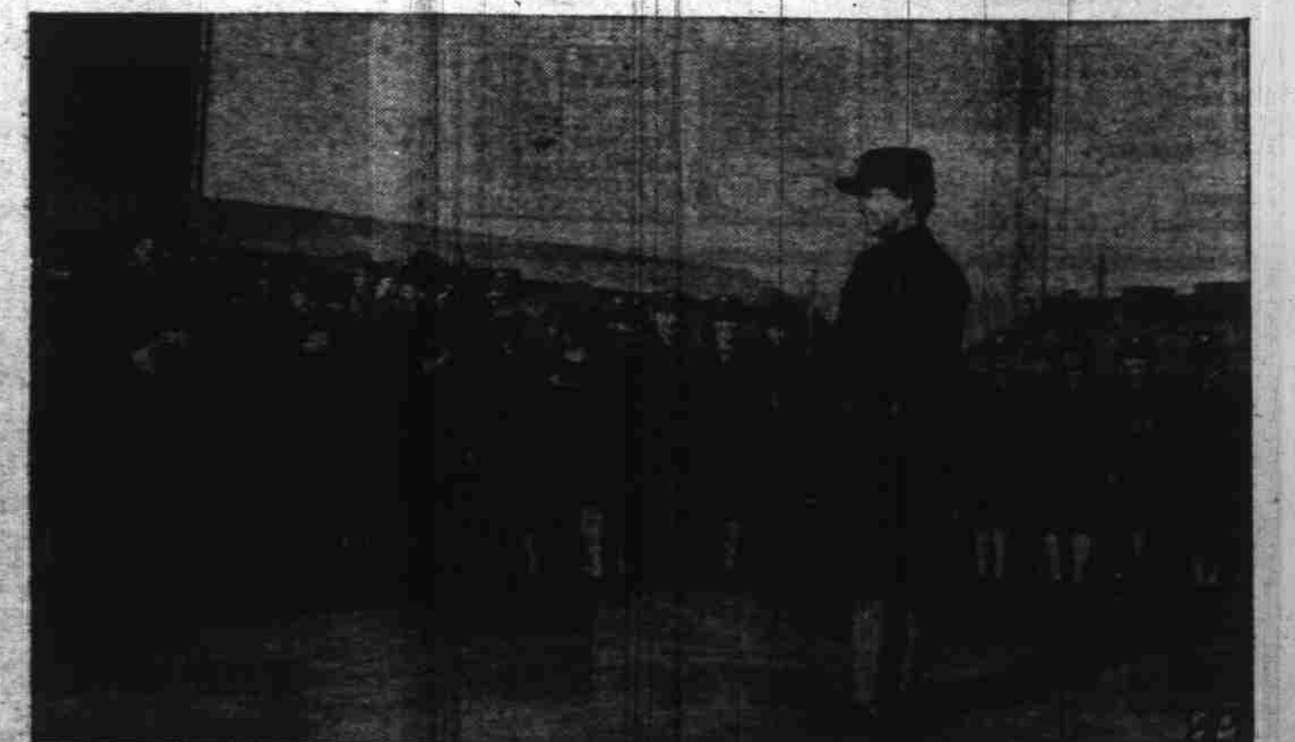
WAACS 'SNAP' THEIR CHIEF —After inspecting units in San Francisco, Col. Overta Hobby, director of the WAACS, poses for snapshots by admirers in the ranks.