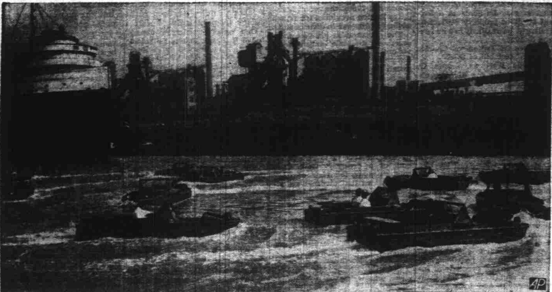
'AMPHIPEEPS' FOR THE ARMY —These new versions of the U. S. Army's peep, equally at home on land or water, undergo tests on the Rouge river near Detroit. The four-wheel drive cars now come off the former Ford assembly line.