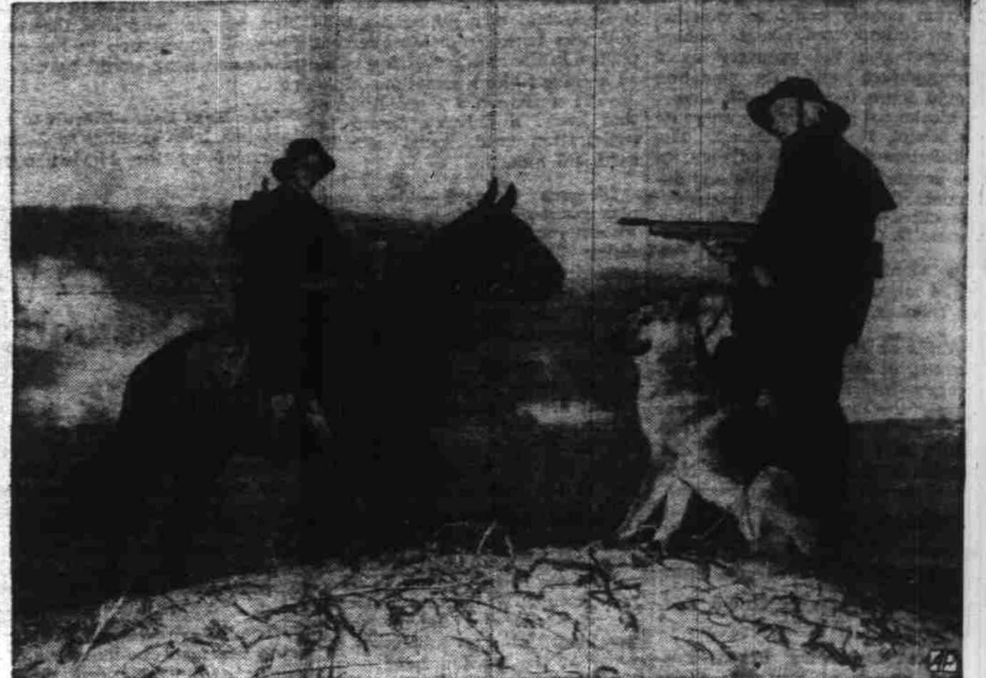
'MOUNTIES' IN COAST GUARD —A new coast guard unit—two men, a horse and a dog—on patrol on the Washington shore. Note portable radio carried by rider.