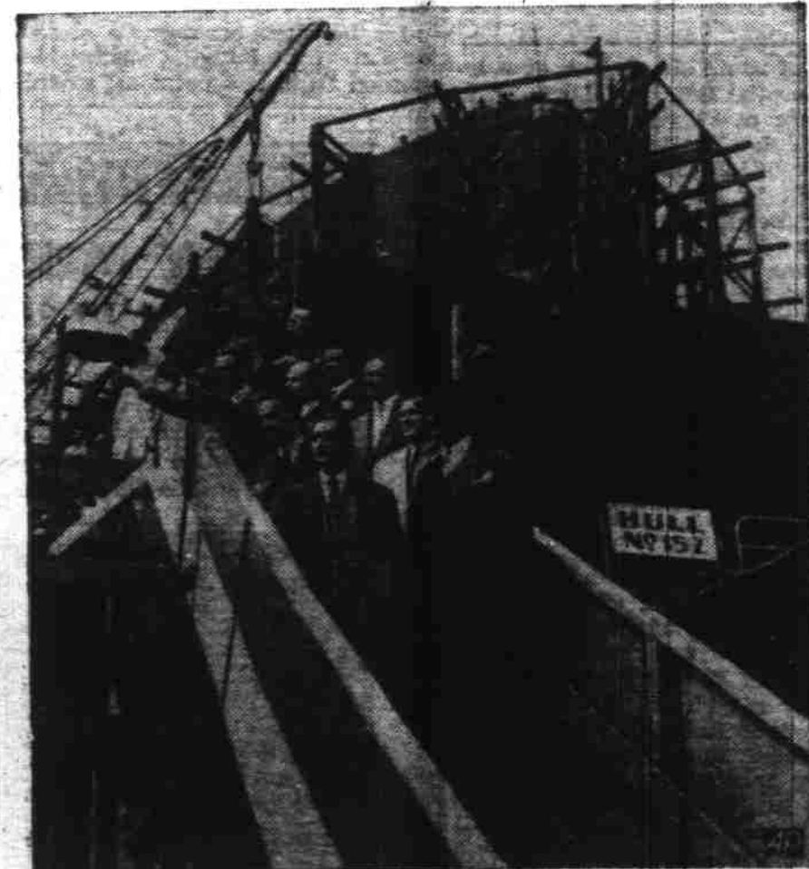
VISITORS FROM SOUTH —Latin American journalists inspect Liberty ship construction in a Los Angeles yard.