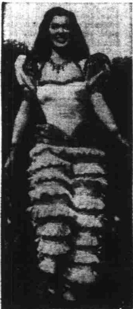
TRIM —Eleanor Powell, noted stage and screen dancer, demonstrates her ideas of an anti-bellum costume modified to take into account the more vigorous dance steps of the present day. It's also better on crowded dance floors.