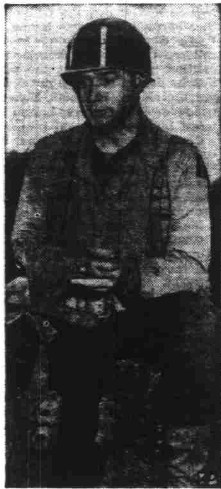
IN THE FIELD —Capt. Winthrop Rockefeller, son of John D. Rockefeller, Jr., snapped in the field during a pause in Third Army maneuvers somewhere in Louisiana.