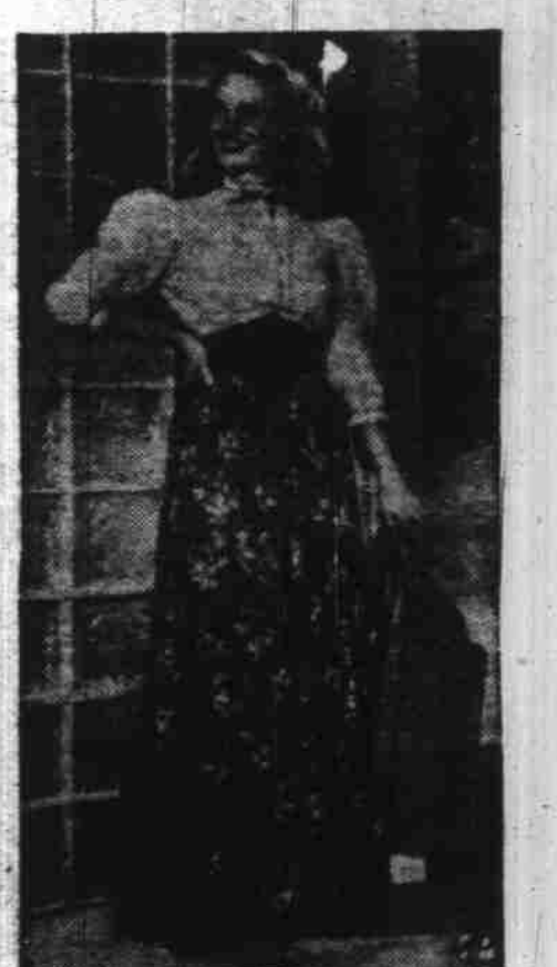
DIRNDL —Quaint rose and blue printed challis dirndl, suitable for informal home wear, is modeled by Barbara Britton. It has eyelet embroidered blouse and a wide waist band.