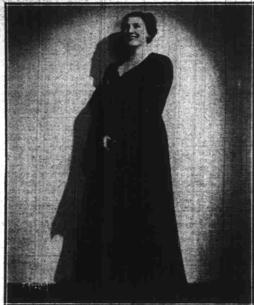
FEATURED ARTIST—Helen Traubel, dramatic soprano of the Metropolitan opera company, who has been chosen to head the list of community concert artists for next year's winter series.