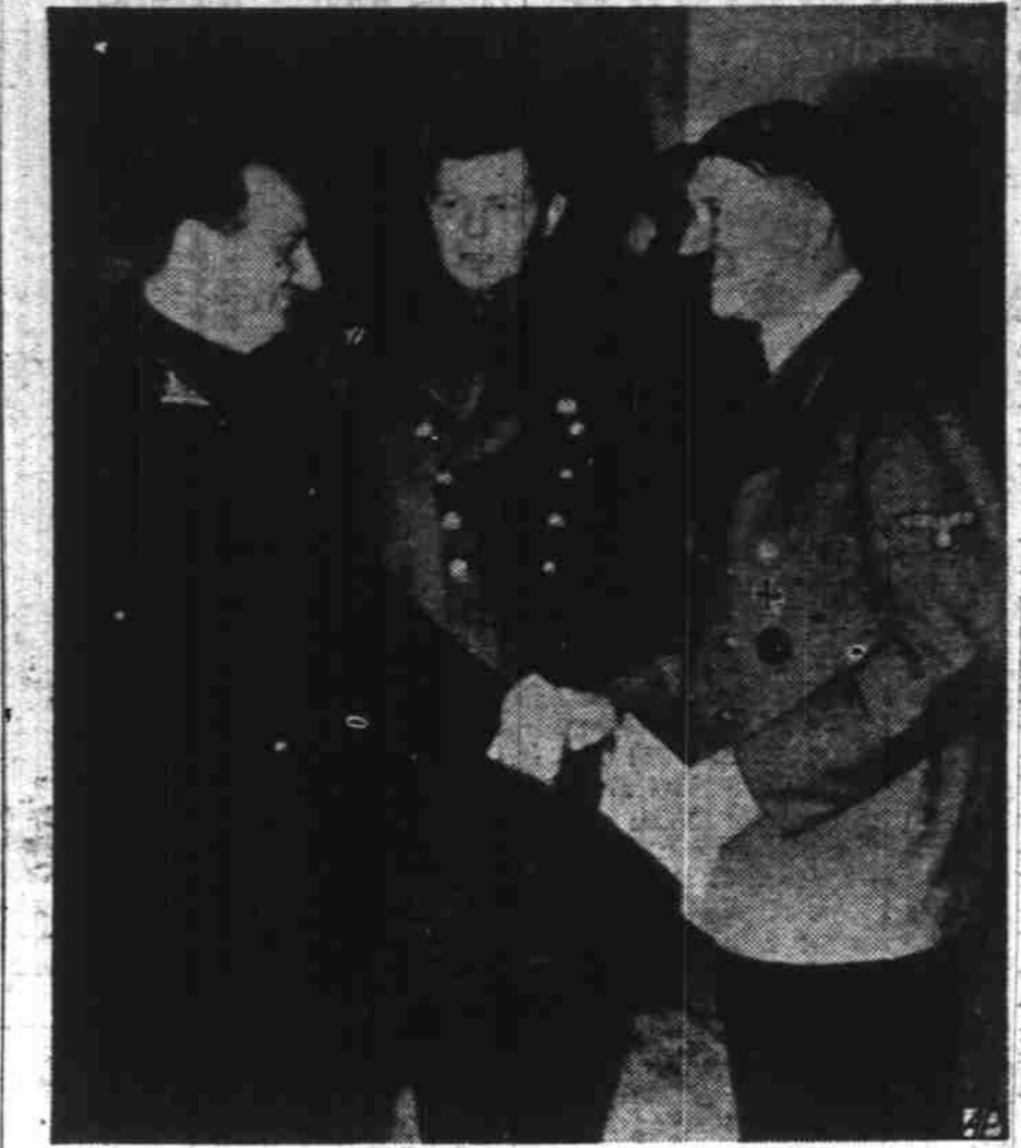
Jose Luis Arrese (left), a member of the Spanish cabinet, is warmly greeted on his visit to Germany by Adolf Hitler at the latter's headquarters. The German caption of this picture received from Lisbon says an exchange of ideas took place in the spirit of sincere friendship between Germany and Spain.