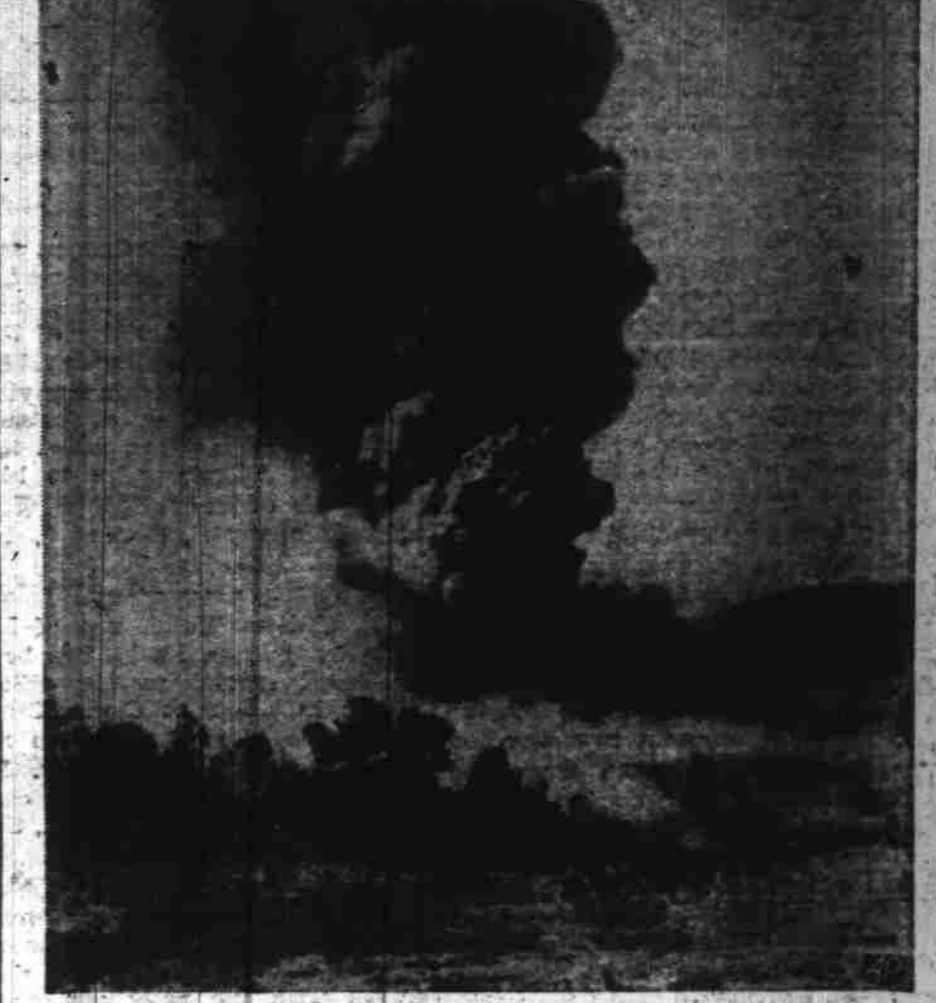
This is a new volcano belching smoke and lava near the Mexican town of San Juan Parangaricutiro, which has been evacuated by its 3000 inhabitants. The hill around it has been piled up by the rocks thrown out since the crater opened on February 18. The volcano is about 100 miles west of Mexico City.