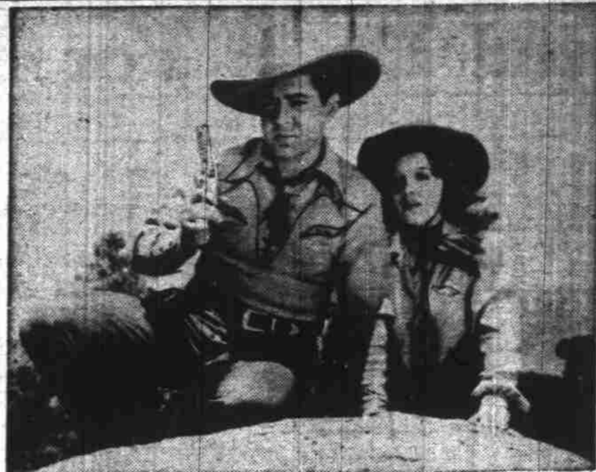
Trigger-quick, romance shy, Johnny Mack Brown and Fusy Knight in "Boss of Hangtown Mesa," now showing at the Liberty theatre, co-featured with "Main Street Girl."