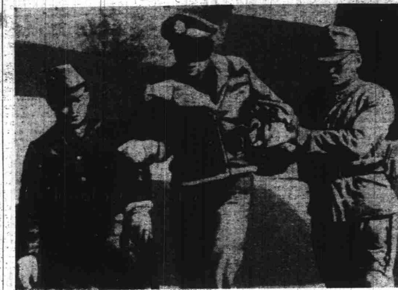
Radioed from London to New York February 25, this photo reprints a picture published in an axis magazine purporting to show an American army air force officer being led blindfolded from his plane by two Japanese gendarmes near Tokyo. The Japs asserted this flier was one of the Americans captured when US planes raided Tokyo in April, 1942.