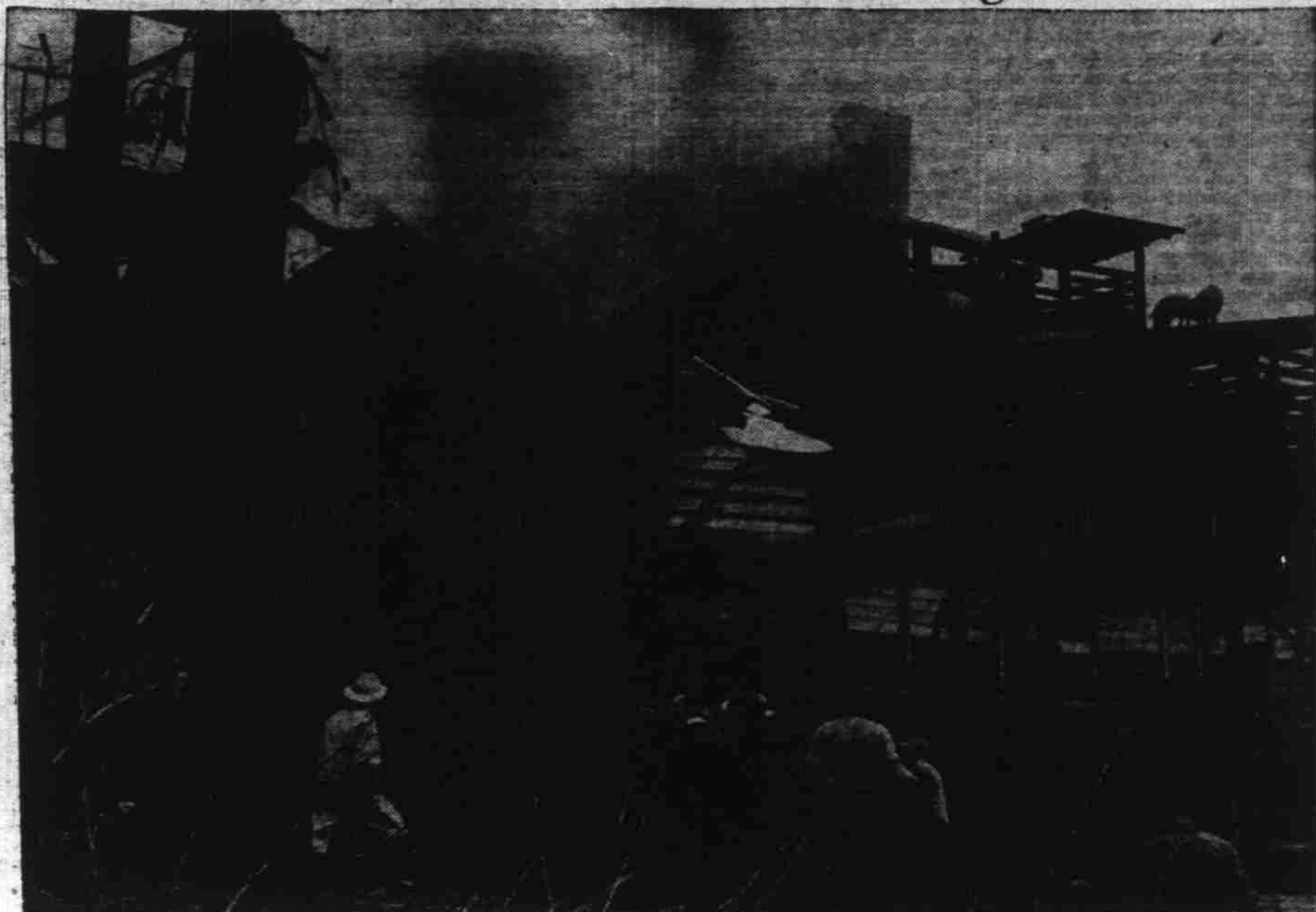
A rescuer (upper center) tried unsuccessfully to reach occupants of a bombing plane which crashed into Seattle's Frye Packing plant building Thursday, while others in foreground rushed to his aid. All 11 plane occupants and several workmen lost their lives in the crash, explosion and fire. A shattered portion of the plane shows in center. At right pigs released from pens by the crash wander atop the building.