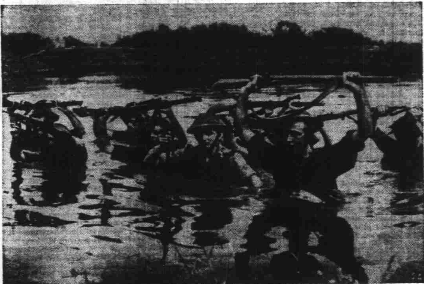
THE BURMA PATROL —British infantrymen hold weapons high as they cross a river during a reconnaissance patrol inside Burma. They are part of increasing forces pressing Japs.