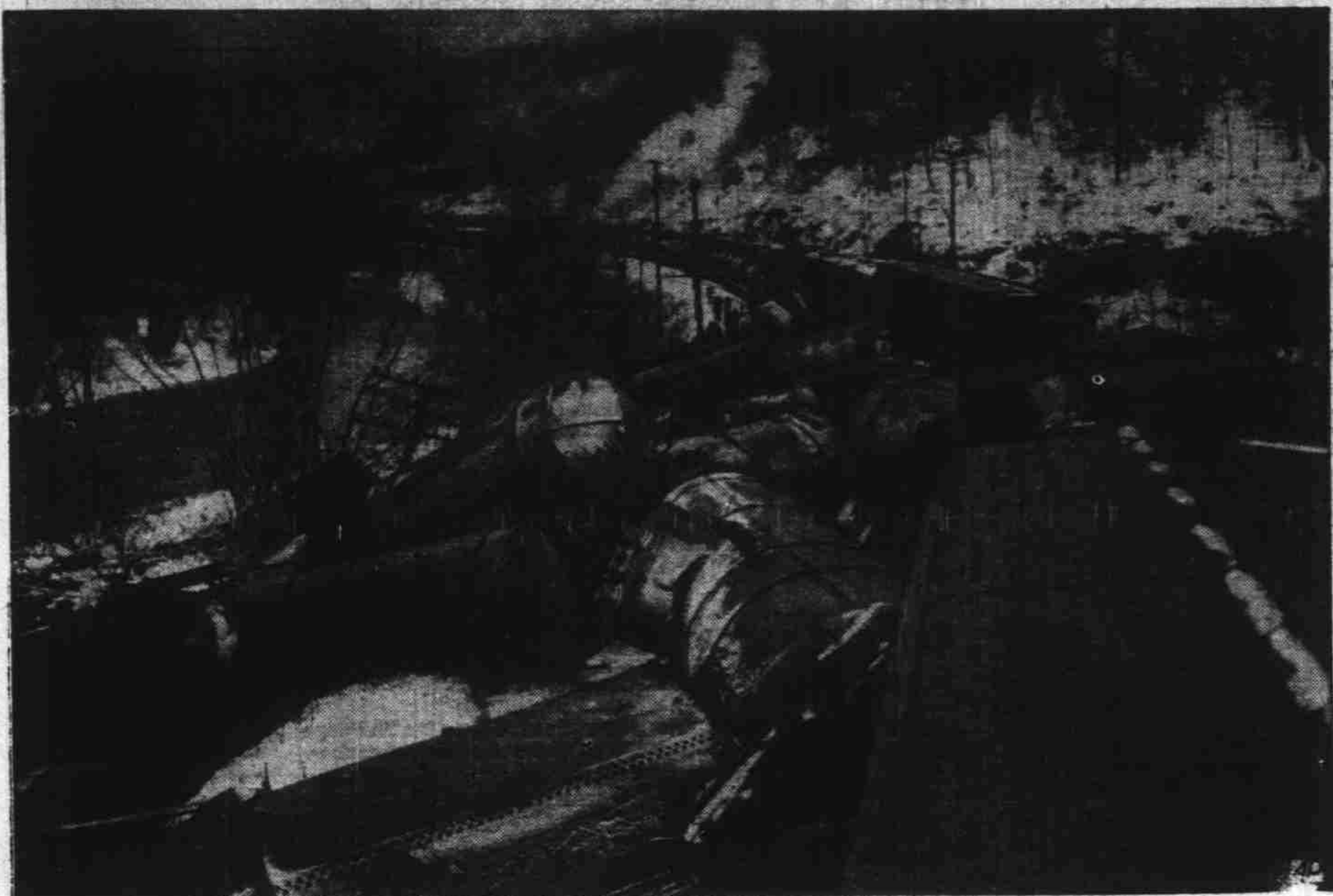
PRECIOUS OIL, GASOLINE LOST —Thousands of gallons of gasoline and fuel oil were spilled into Chartiers creek near Pittsburgh, Pa., when 13 tank cars and three freight cars on two trains were derailed on Pennsylvania line.

Plane Crash and Fire Wreck Packing Plant