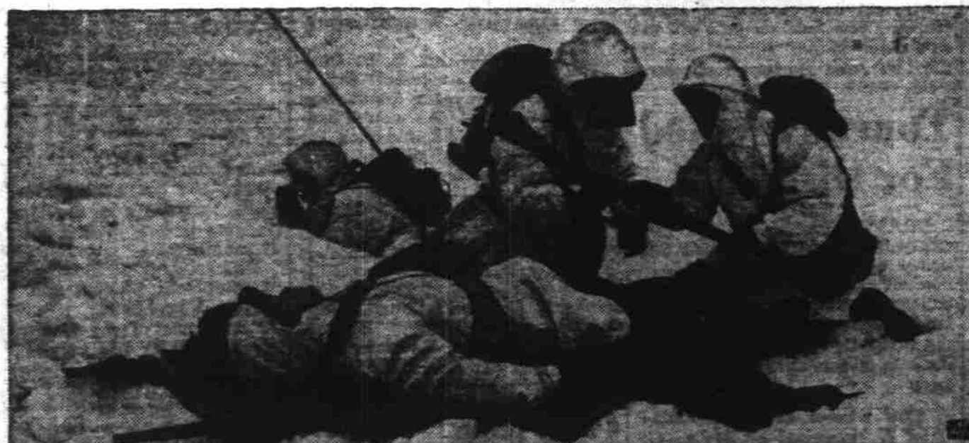
RIFLE SPLINT APPLIED —White clad Army Medical Corps men training near Womalan- cot, N. H., apply a rifle splint to a "wounded" man lying on a stretcher in the snow.