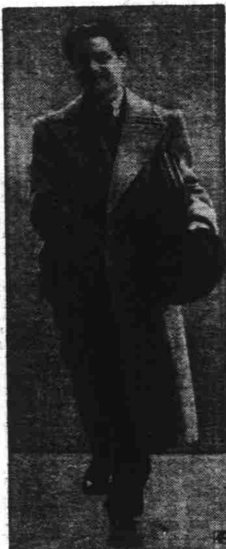
PROTESTS —Robert Donat (above), British stage and screen actor, arrives at House of Commons in London to protest opening of England's theaters on Sundays.