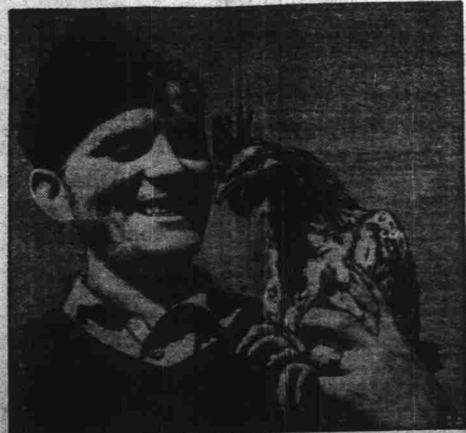
RAF MASCOT —This rooster is the mascot of a North Africa desert squadron of the RAF. An orderly holds him.