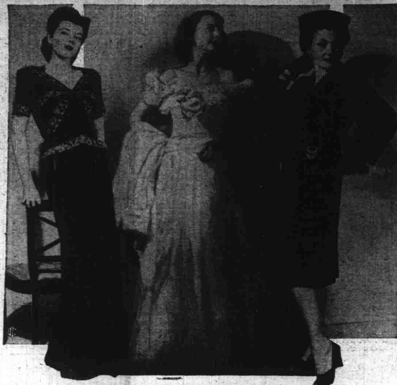
Left, black silk faille dinner dress; center, white illusion net; right, brown velvet daytime frock. The Christmas season this year promises to be very gay. There will be many parties. Whether you are spending every minute with a husband on furlough, a fiance on leave, or are just out to make the holiday season a pleasant one for the boys who are far from their homes, you'll want to look your smartest, prettiest and most feminine. At a recent New York fashion show the three costumes shown above were modeled. At left a long dinner dress made of black silk faille, with long torso top and gathers in the front of the skirt. Pastel beaufaiva embroidery is used around the neckline, short sleeves and on the bodice. For the big dance the gown shown center is the debutante's dream of white illusion net with a ruffled bouffant skirt, horizontally shirred. The bodice is fitted and feathers outline the off-the-shoulder Victorian neckline. The short street dress, right, is perfect for luncheon dates, cocktails and other afternoon doings. It is made of rich brown velvet in bolero style with faille midriff which gives a slender waistline. A jewelry watch bob pin is worn at the waist, and brown suede gloves, brown velvet hat and brown suede shoes complete the costume.