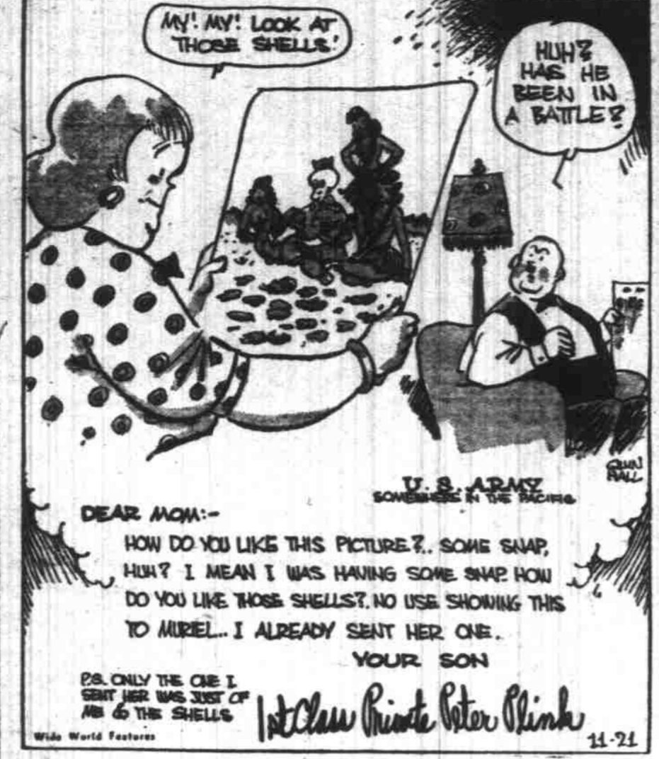
U.S. ARMY SOLDIERS IN THE PACIFIC. YOUR SON