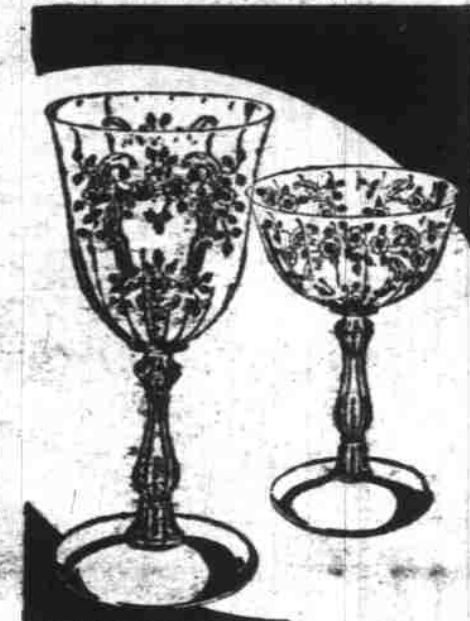
MEADOW ROSE Fostoria