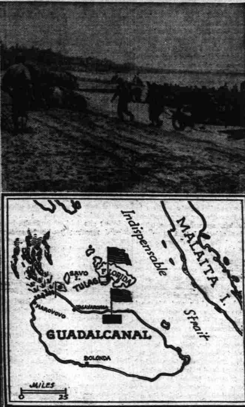
These pictures of Guadalcanal, strategic island in the Solomon group, will help you better understand and follow the news of the great land-sea battle now being waged between reinforced American forces and an enemy armada of battleships, cruisers and destroyers. At the top left, a section of the important airfield on Guadalcanal, heavily bombed by Jap planes; top right, US marines landing on the island in August; lower left, view of the village of Marovo on the northwest coast, now in the center of action; lower right, map of Guadalcanal and surrounding islands. Guadalcanal is about 30 miles wide and 100 miles long.—IIN Photos.