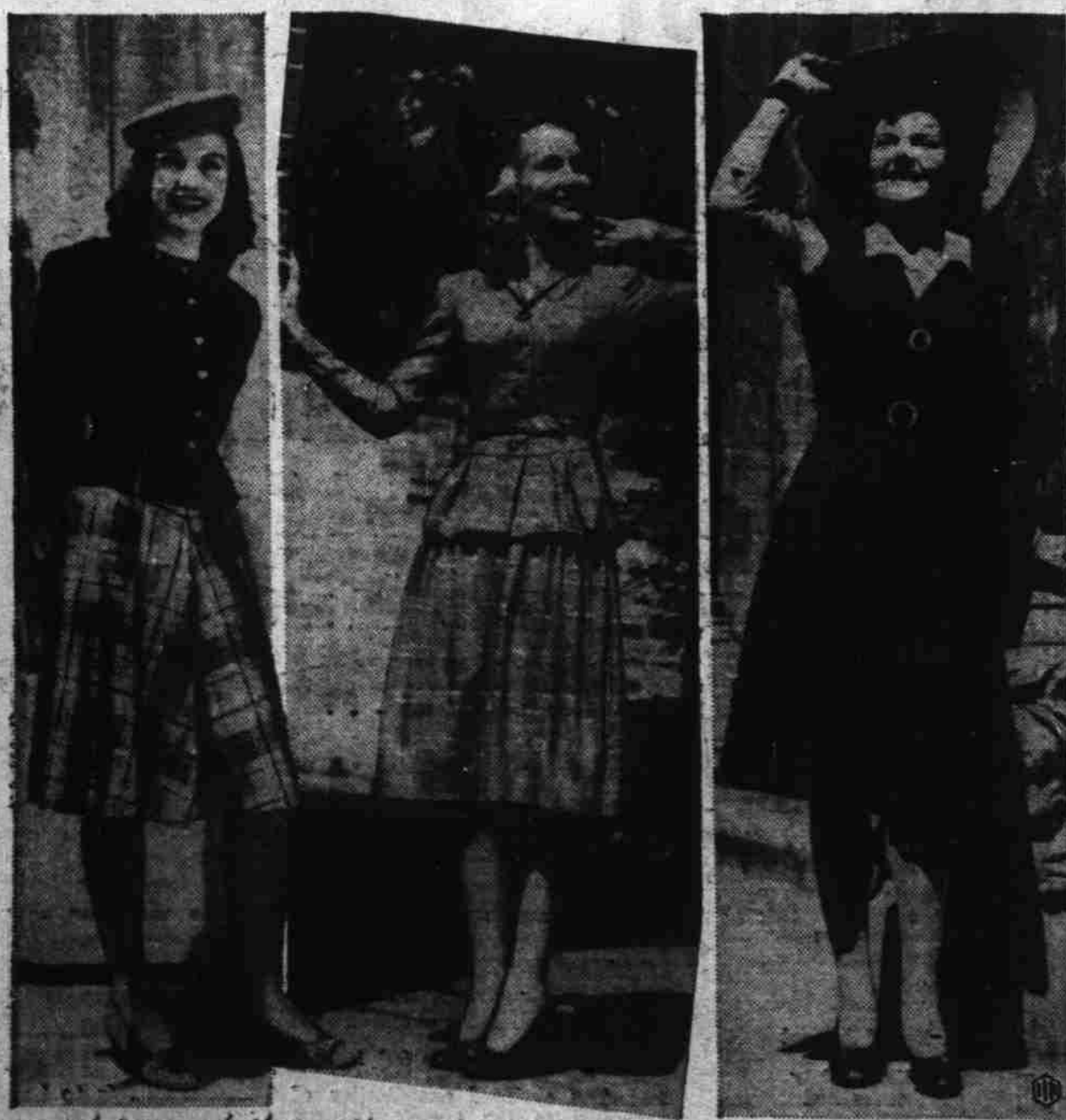
Left, velvet bodice, plaid skirt; center, wool dress with poplin skirt; right, chocolate brown pinafore frock, plaid blouse.

Now is the time for all good women to come to the help of their Uncle Sam and make their own clothes, helping to conserve materials. The youthful style dress, left above, consists of a velvet jacket with gold buttons, and slit at the jacket's bottom edge, and a plaid semi-taffeta fabric skirt which combines the brown of the top with blue, red and beige. The second dress is a figure flatterer. It has a perfect fitting bodice and a carefully designed poplin skirt. Buttons and belt are of leather and sleeves are long and fitted. The dress is wool. A minimum of fabric is used for the skirt, simple pinafore type of dress. It is made of plain material in rich chocolate brown. The blouse worn with it is plaid, but any number of different combinations could be used to give the costume a different air.