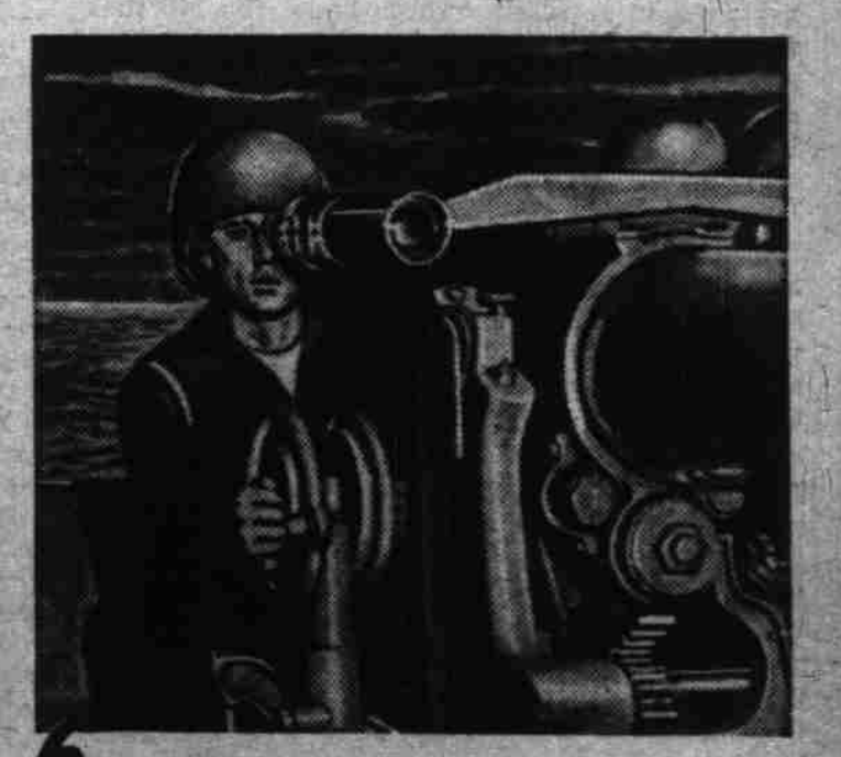
De You get action, travel, adventure! You go places, meet people in the Navy. And you do big things for your country. Deeds of courage and hero-ism. Deeds that are writing history. The kind of deeds that are making the U.S. Navy the finest on the seas. Here's your chance for real service. Take it now while you still have time to choose!

You get good pay, quick promotion! After a month, plus allowances. And remember, your pay is all yours, because your meals, quarters, clothing, medical and dental care are free!