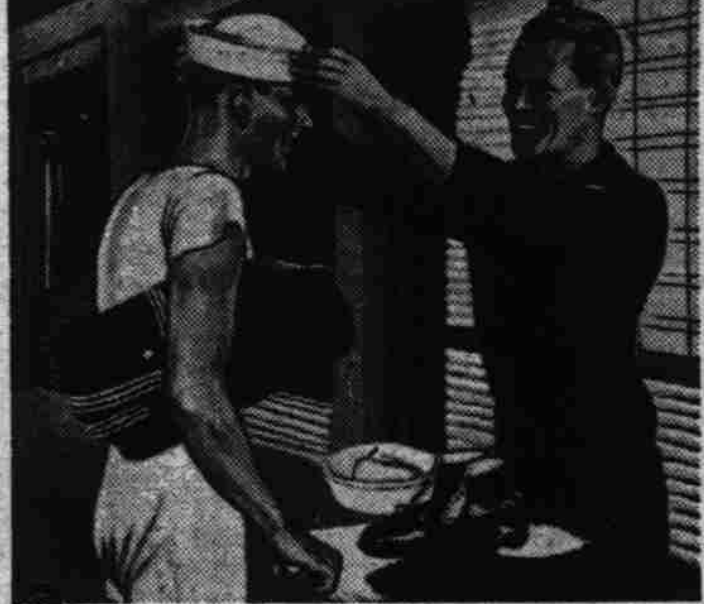
Le You get free clothing-$133 worth! Complete uniforms for both winter and summer. You'll be proud-and rightly so-when you step out in your smart Navy blues. From then on, you soon get into the swing of real Navy life. You learn Naval history, Naval regulations, Naval traditions.

· You're off to training station! And what a thrill it is! The Navy takes care of all your expenses. Meals in the dining car. A Pullman berth for overnight travel. When you arrive, you'll find comfortable quarters waiting for you. And you'll meet the swellest bunch of shipmates in the world!