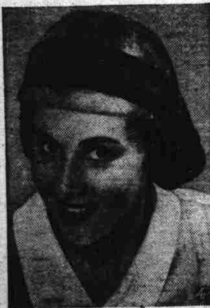
HOLDS HAIR —This clear plastic helmet is designed to keep women's hair from flying about in war plant work.