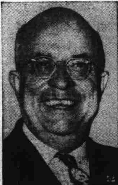
SHIPBUILDER —Henry J. Kaiser (above), west coast shipbuilder, plans to build huge cargo planes.