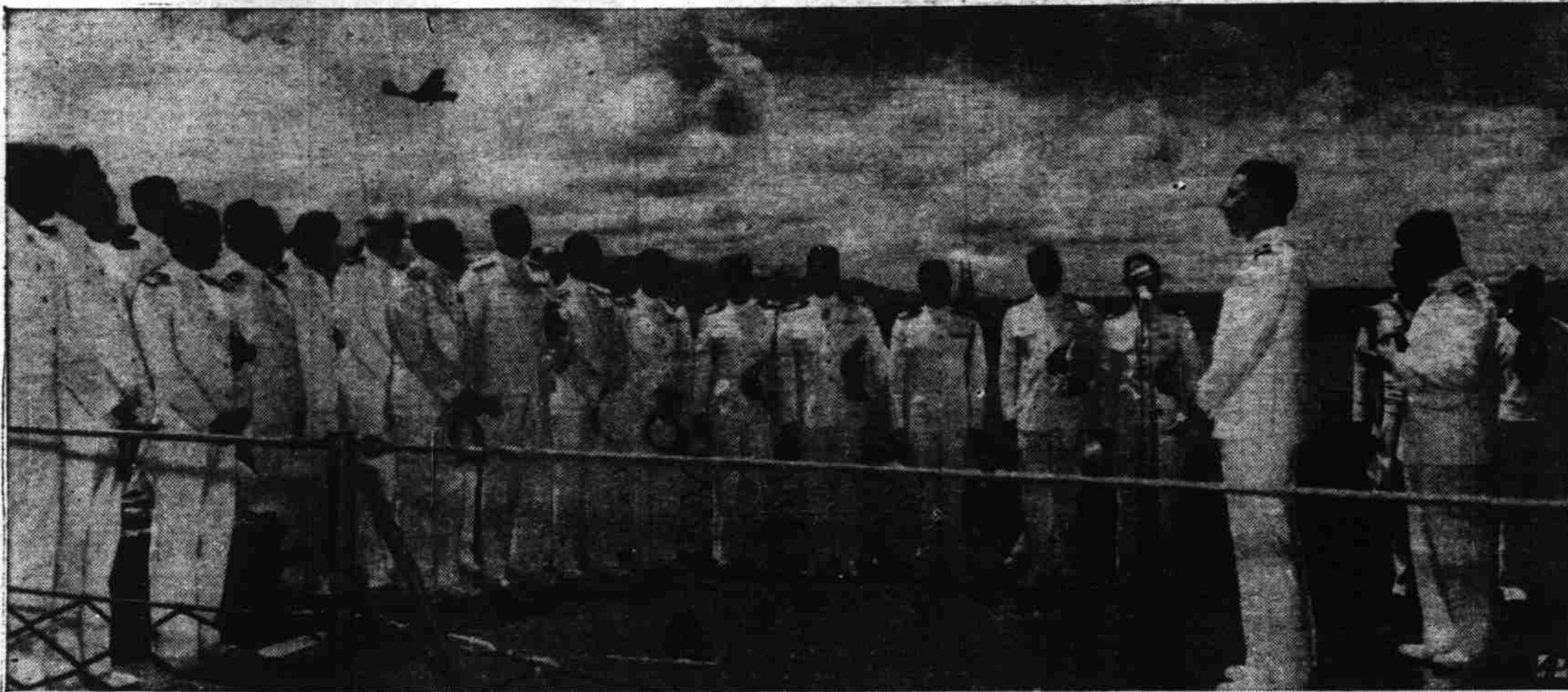
HONORING THE BRAVE DEAD —Officers of the Pacific fleet stand aboard a ship at Pearl Harbor in ceremonies honoring brother officers and men lost in the sinking of the destroyer Sims in the Battle of the Coral Sea and destroyer Hammann, lost in Battle of Midway.