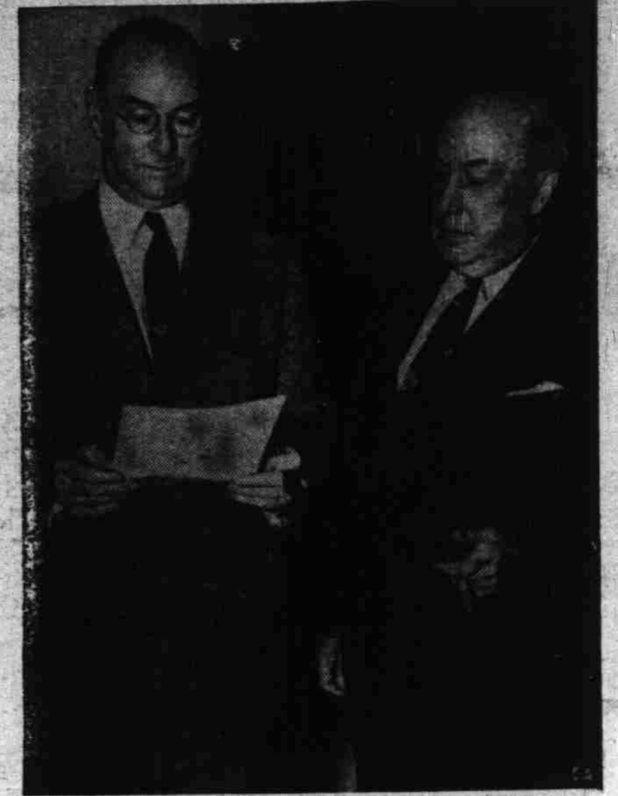
THE BOSS AND RUBBER CZAR —War Production Chief Donald M. Nelson (left) confers with William M. Jeffers, president of the Union Pacific railroad and new rubber czar. Nelson called Jeffers' job "one of the toughest."