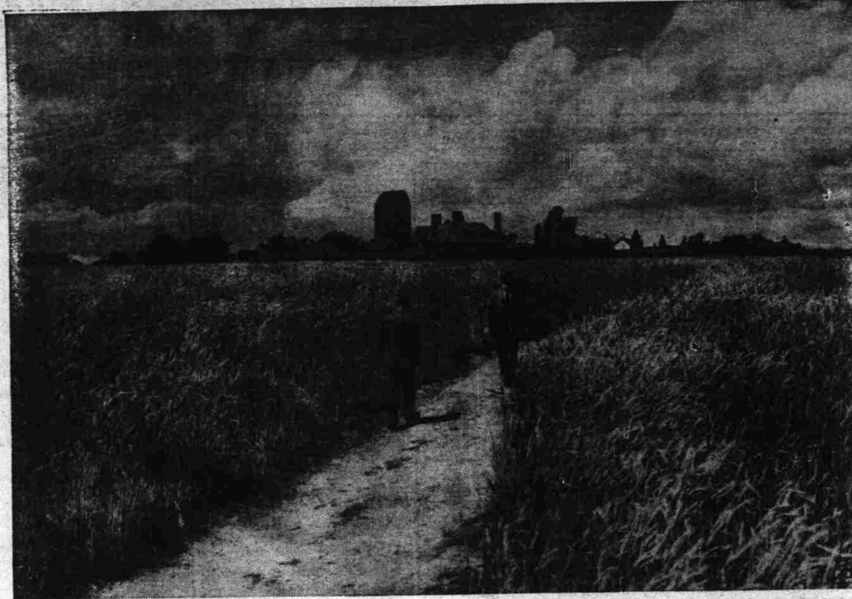
COMING THROUGH THE RYE —Men walk through a field of rye covering hundreds of acres of former common land at Walton Heath, Surrey, England. This field is part of Britain's effort to become independent of foreign foods.