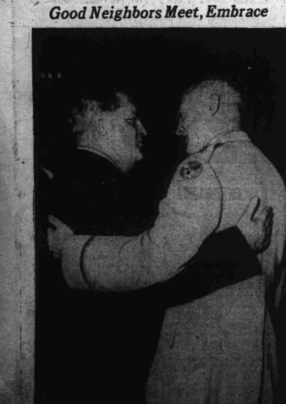
Dr. Carlos Martins, left, Brazil's ambassador to the United States, welcomes Lieut. Gen. Henry Arnold, chief of the U. S. air force, as the two meet for the first time at a White House war conference attended by high diplomatic and military officials of North and South American countries.