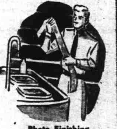
Photo Finishing Films Developed do expert work. Any 8-exposure developed and 1 print of each FOR 30c

8MM Kodachrome Color 25 ft., $3.65 SMM Panchromatic, Super