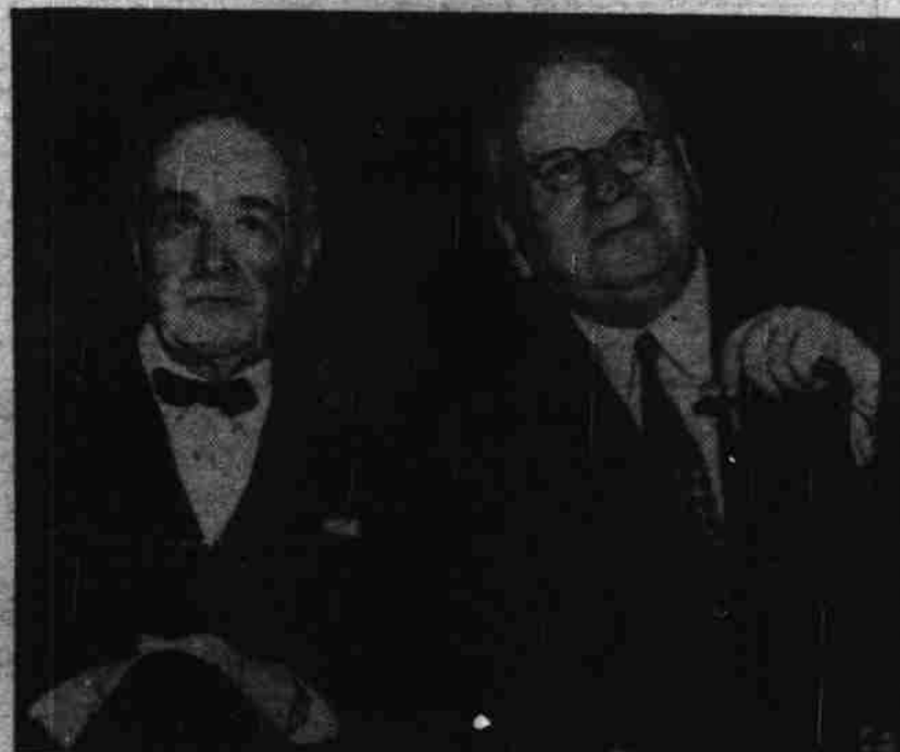
LITVINOFF AND CONDUCTOR. —Soviet Ambassador Maxim Litvinoff (right) sits with Boston Symphony conductor Serge Koussevitzky after a concert at the Berkshire Music Center near Lenox, Mass.