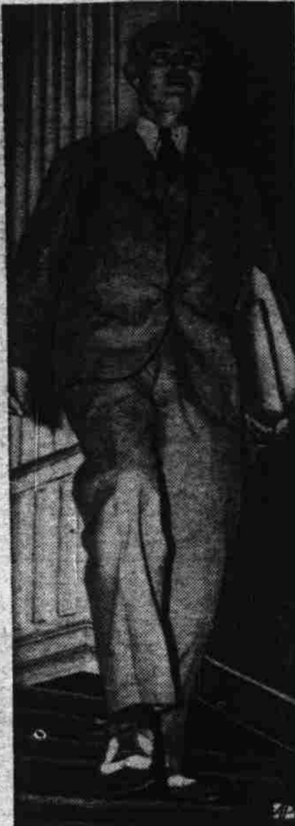
REPORTS. —Joseph C. Grew, U. S. ambassador to Tokyo until Japan attacked Pearl Harbor, leaves Secretary of State Hall's office after reporting in Washington, D. C.