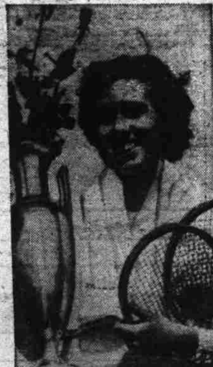
WINNER. —Doris Hart, 17, of Miami, Fla., smiles as she holds trophy after winning United States girls' tennis crown at the Philadelphia, Pa., Cricket Club.