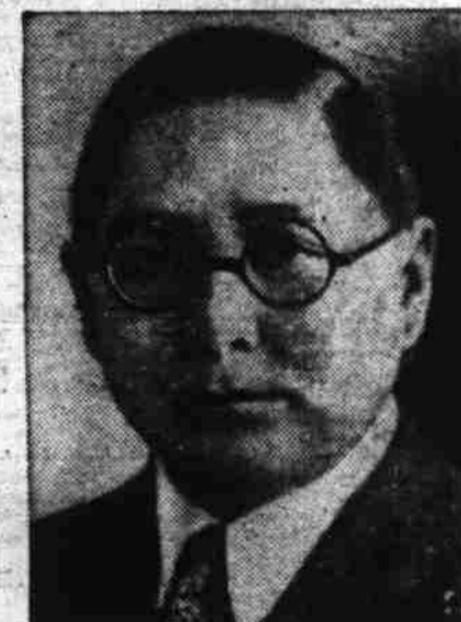
BACKS INDIA. —Dr. Sun Fo, Chinese leader, says "Chinese sympathy is entirely with the Indians" in freedom struggle.