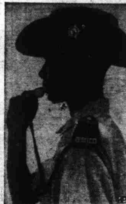
ARM OF LAW. —This policeman directs traffic in Asmara, capital of Eritrea, under British control in Africa.