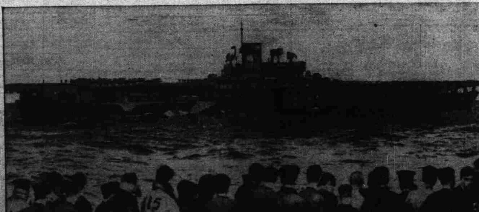
AMERICAN CARRIER WITH BRITISH. —Crew of British cruiser Edinburgh line the rail (foreground) to watch the arrival of the U. S. aircraft carrier Wasp in British home waters as part of U. S. force joining the British Home Fleet.