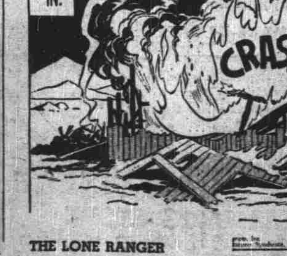
THE LONE RANGER