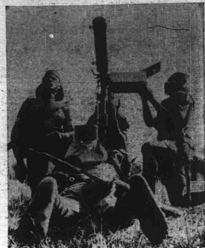
Native troopers of the Belgian Congo man a machine gun set up for anti-aircraft fire at the Belgian army post at Leopoldville, on the famed Congo river.