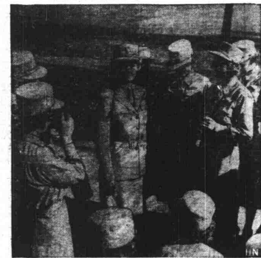
It was a big day for the camera fans among the Women's Army Auxiliary Corps' members at Fort Des Moines, Ia., when the "Wacks" staged their first parade and Mrs. Oveta Culp Hobby, national director of the organization, obligingly posed for such "shots" as this one.