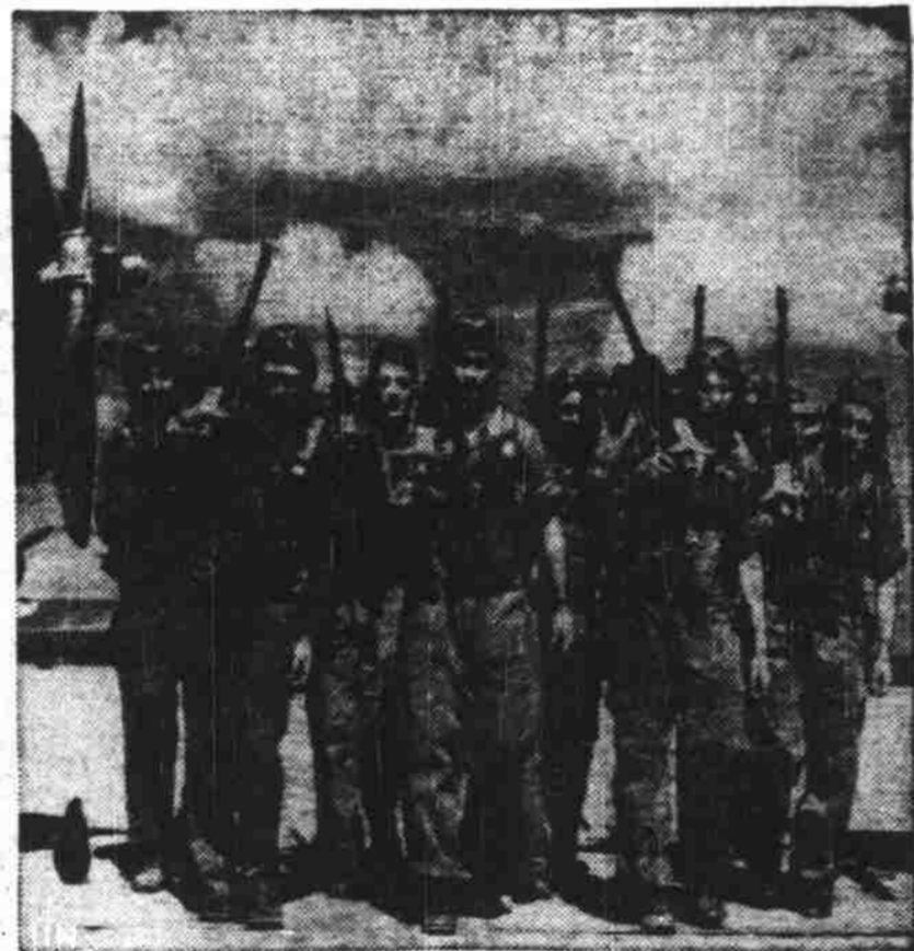
Machine guns over their shoulders, aerial "triggermen" are shown on their way to their training planes which will take them aloft for their daily gunnery lesson over the Gulf of Mexico. The men, stationed at the Harlingen, Tex., Army Gunnery School, will be transferred to bomber combat crews upon completion of their course.