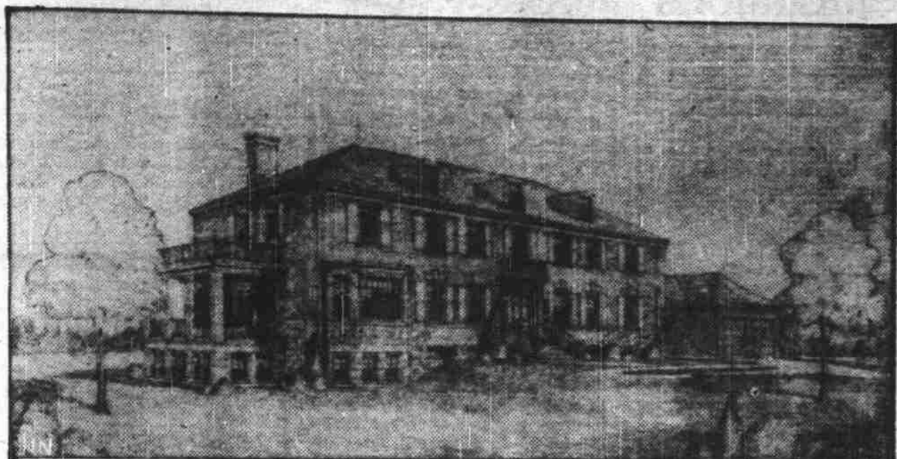
This is an architect's drawing of the Georgian mansion now under construction at Callander, Ontario, for the Dionne quintuplets, their parents and brothers and sisters. The house will have more than 25 rooms and will be completed some time this year.