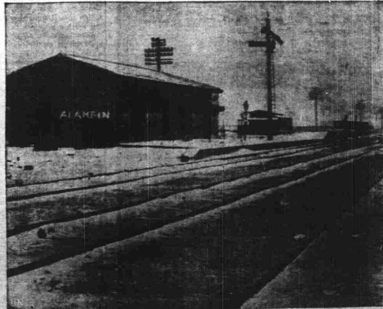
The average American would call this a whistle stop, consisting as it does of a deserted railway station and half a dozen cottages, but some day Alamain may rank in history as a famous battle site. It is outside this desert rail center, 89 miles west of Alexandria, that the British have been holding off