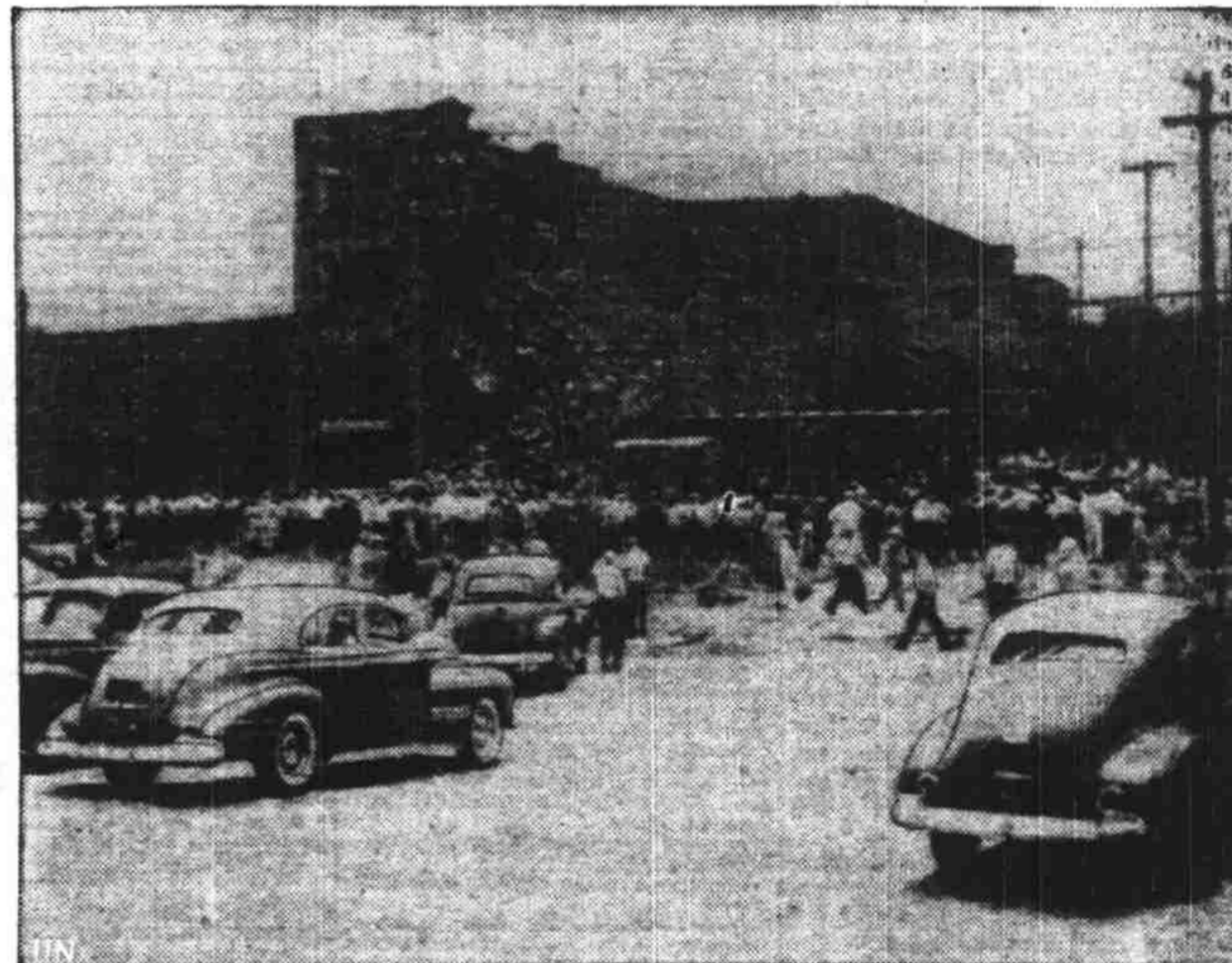
Here is the wreckage of a four-story warehouse in Milwaukee, which collapsed, killing an estimated 12 men and injuring 10 others.