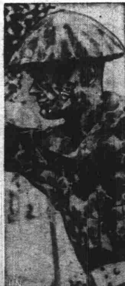
Camouflaged to blend into wooded surroundings, an American soldier is shown wearing a "sniper" suit.