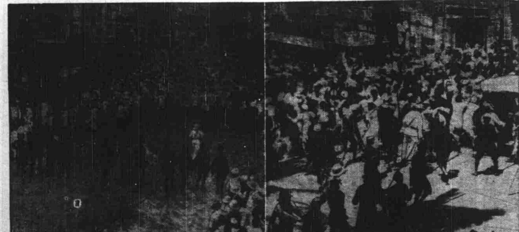
Rioting in Bombay several years ago