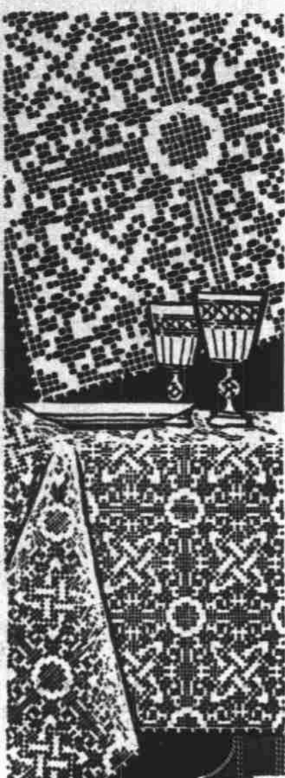
By Laura Wheeler

You can acquire luxury a square at a time for that's how this lovely filet crocheted cloth is worked. Crochet the squares to make smaller accessories—a dainty scarf—mats—or pillow top! Pattern 381 contains chart and directions for square; illustrations of stitches; materials required.