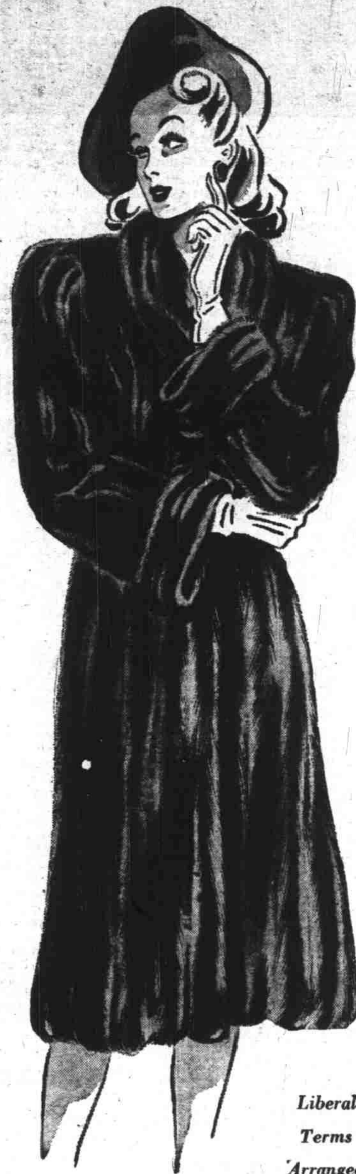
Liberal Terms Arranged

Now more than ever—a good Fur Coat is a long term investment. It will pay you big dividends in years of beauty, warmth and wear. Choose your fur coat here with confidence... A PRICE label guarantees you the choicest pelts, long lasting style and expert workmanship.